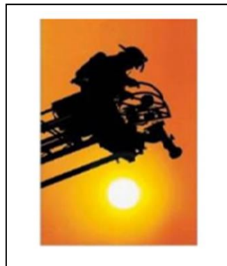
Fig.5. Example of processed images.

The types of forgeries described in this subsection and the next do not necessarily fall into the traditional definition of image tampering i.e. there is no addition or hiding of information. However, as in the case of the image tampering discussed in this subsection, the reality portrayed by an image processing operation can be distorted at a psychological level. Samples of such tampering are shown in Fig. 5.