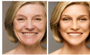
(a) Original Image (b) Retouched Image

Fig. 4. Example of retouched image.