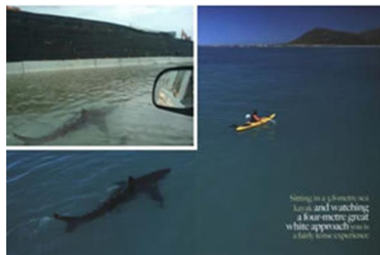
Fig. 2. Example of sliced images.

One of the types of image tampering is splicing or composition or photomontage. In such a forgery, elements from multiple images are often juxtaposed in a single image to convey an idea that could not have been conveyed by any of the original images. Such an idea usually does not reflect reality, and so such spliced images can be very damaging. Examples of some prominent image forgeries are shown in Fig. 2.