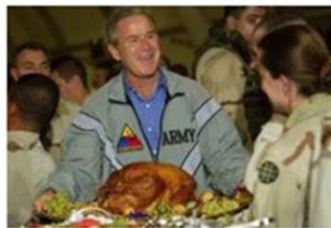
Fig.6. Example of false captioning images.

The last type of image forgery that we discuss is probably the least like the other three types seen so far. In false captioning it is possible that the content of the image is not touched at all, but the caption of the image, which provides context, is changed from the actual situation with intent to mislead the viewer or reader. Examples of images where false captioning has been used are shown in Fig. 6. Apart from actual image captions, other informative elements like metadata (which can provide geographical or temporal context), may be tampered without changing the image content. Such tampering also falls within the category of false captioning.