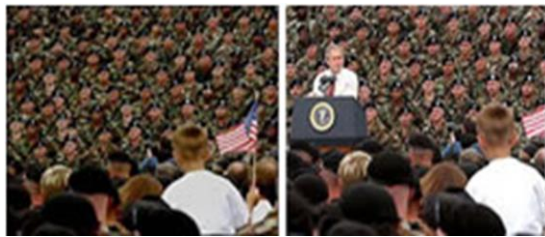
Fig. 3. Example of copy-move forgeries.

Another common type of image forgery is the copy-move (or region duplication or cloning) forgery. In this type of forgery, regions from the same image are copied and pasted (with possible transformations) in the same image. This is usually done with the intent of hiding certain content present in the original image or duplicating certain content not actually present in the image. Some examples of copy-move forgeries are shown in Fig. 2