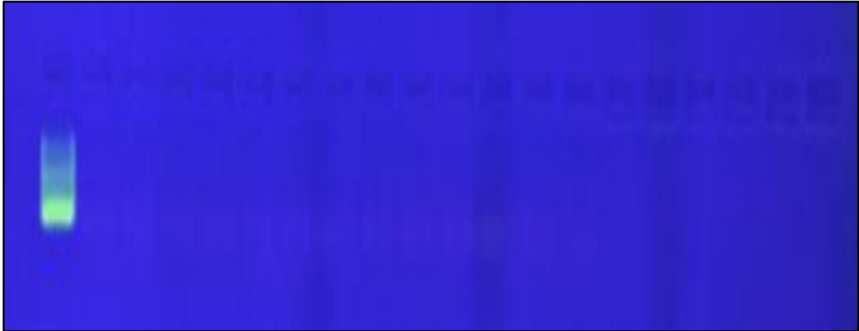
Figure 2. Gel showing only faint bands of short nucleic acids (<100 bp). From the left: Ladder (100 bp), negative control, C435, C439, C449, C454, C574, C591, C692, C700, C708, C727, C732, C735.

Since one run of real-time RT-qPCR yielded somewhat curious results, a gel electrophoresis was performed, including PCR products from 12 of the cattle samples. The samples were picked based on that they showed signs of some amplification during the real-time RT-qPCR. The gel showed only diffuse bands of short nucleic acids (<100 bp), see Figure 2 below.