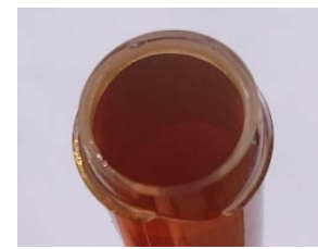
Figure 1. Contact plate

Custom made contact plates were manufactured with modified Dixon's medium (National veterinary institute, Uppsala, Sweden) in test tubes with a 13 mm diameter, see Figure 1. These were made in two separate batches for the different study periods: 2016-05-04 for May and 2016-09-02 for September/October.