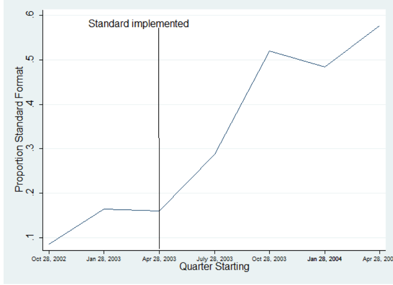
Figure 1: Standardization Over Time