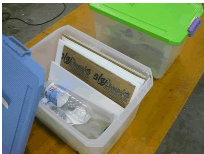
Figure 1 Example kit that will be provided to sophomore design students

The devices will be made from materials provided in a kit (Figure 1) given to each team of students (assume 4 students per team). Materials in the kit will have assigned costs, so the students can compute the cost of their design (see also note at start of the proposed kit contents section below). The kit includes readily available, relatively inexpensive materials that can be incorporated into a design in a number of ways and can be easily fabricated and assembled, such as foamcore, plastic water bottles, and aluminum sheet.