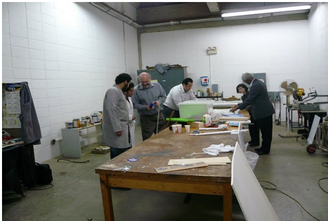
Figure 2 Preparing the sophomore design class laboratory space with KFUPM and MIT faculty and KFUPM students