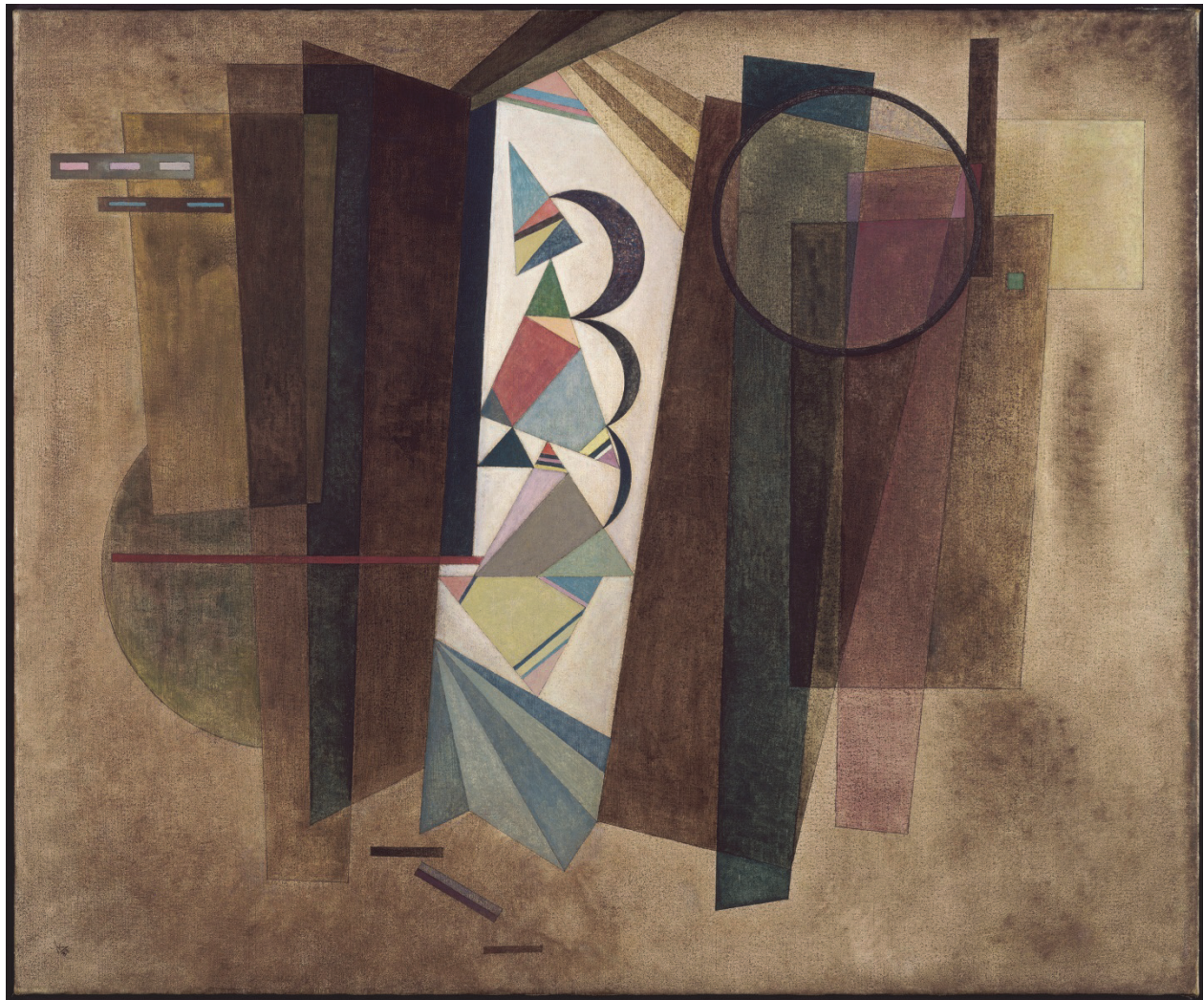
Figure 1. Wassily Kandinsky, Entwicklung in Braun, 1933, oil on canvas, 101 x 120.5 cm, musée Cantini, Marseille.

Given the rich readings to which Entwicklung in Braun lends—and even then lent—itsself, given his account of events to Rebay, for Kandinsky to insist as he did to Kojève that his decision to leave Germany had nothing to do with politics but only art seems, if not disingenuous, then willfully naïve, certainly in the face of a regime that repudiated such distinctions. What he meant, however, was that the move did not reflect any abiding political conviction on his part, beyond, of course, the essential tenet of his own artistic ideology, namely that art, in dreaming of the infinite, must remain free of such worldly concerns. Throughout the 1930s Kandinsky adhered to this article of his creative faith the more sorely it was tested. The