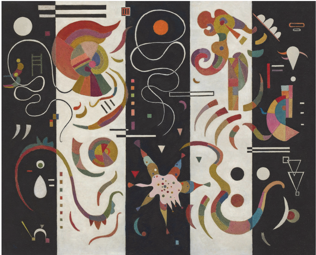
Figure 3. Wassily Kandinsky, Rayé, 1934, oil with sand on canvas, 81 x 100 cm, New York, Solomon R. Guggenheim Museum, Solomon R. Guggenheim Founding Collection, 46.1022.

Kandinsky had long ago accepted the inevitability of “experiencing” others’ work, which, far from undesirable, rendered one’s soul more sensitive, refined. “Experiencing the works of others, in this sense, is the same as experiencing nature .” 25 Yet when the artist wrote to Alfred Barr to stress the unconscious fashion in which the light and natural setting of Paris had transformed his work, it was precisely to refute the director’s unsurprising observation that “in the last few years [Kandinsky] has turned to more organic forms, perhaps under the influence of the younger Parisians Miró and Arp, to whom he pointed the way twenty years