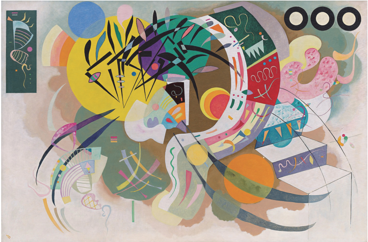
Figure 7. Wassily Kandinsky, Courbe dominante , 1936, oil on canvas, 129.2 x 194.3 cm, New York, Solomon R. Guggenheim Museum, Solomon R. Guggenheim Founding Collection, 45.989.

In the aptly named Courbe dominante of 1936 (Fig. 7), an illusionistic set of stairs ascend into the upper sections—the “heavens”— of the painting, where the central arabesque, inscribed with delicate hieroglyphs, unfurls in the mist, scything its way through the painting like an extravagant question mark. Overlapping, luminous orbs shine through the haze, overlaid with organic elements and black, calligraphic flourishes more reminiscent of the sinuous, decorative nineteenth-century forms of the artist’s youth. Grohmann later remarked upon the “Russian or Asiatic splendor” and “enamel colors” of these large horizontal canvases, likening their “epic breadth,” serpentine lines and densely interwoven forms to the intricacy of Chinese embroidery on silk and the “passionate curves” of Chinese painting on scrolls. 67