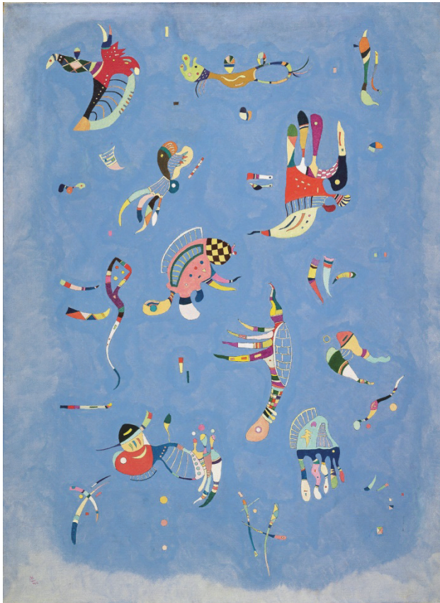
Figure 10. Wassily Kandinsky, Bleu de ciel , 1940, oil on canvas, 100 x 73 cm, Paris, Centre Georges Pompidou, Musée national d'art moderne.

loose, curvilinear forms for their power of suggestion, and while Kandinsky thoroughly disliked the group's politics, in Paris he began to employ similarly vivid forms both to make visible his own "internal view" and to give his viewer an "experience of the small and the great." 84 To heighten the emotive effect of these forms, Kandinsky played upon tensions between surface and illusionistic space, a frequent subject in his pedagogical texts, drawing on formal techniques—including color transparencies, weight reversals, and the incorporation of sand—that were similar to those the Futurists were using, a group with which he readily interacted. Conversely, unwanted associations with Cubism plagued Kandinsky in Paris, and the way he deliberately relaxed the geometric syntaxes and structural principles of his "cold" Bauhaus painting in favor of dynamic forms