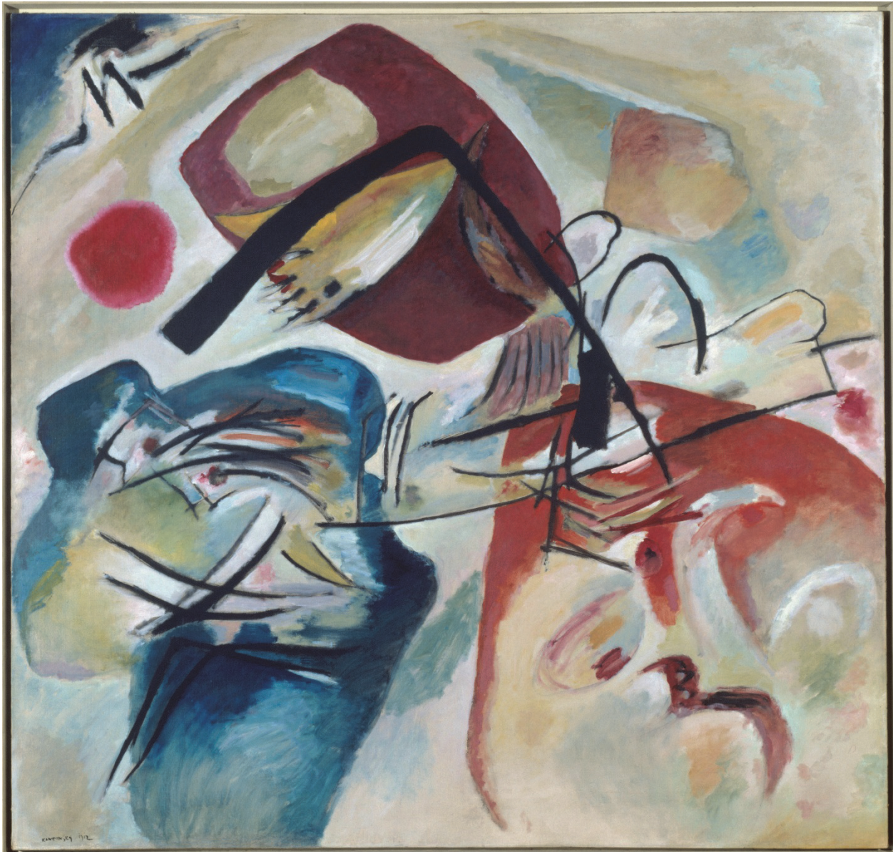
Figure 9. Wassily Kandinsky, Mit dem schwarzen Bogen , 1912, oil on canvas, 189 x 198 cm, Paris, Centre Georges Pompidou, Musée national d'art moderne.

Prominently displayed in the center of the artist's allocated space, the eponymous black arc of Mit dem schwarzen Bogen accordingly functioned as a prophetic marker, pointing the way to the "self-contained universe" of Kandinsky's creation as it appeared on either side, to the black lightning bolt dissecting Auf Weiss II , to the black darts punctuating Courbe dominante . 72