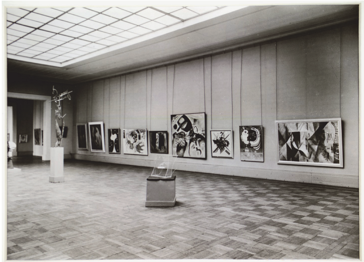
Figure 8. Photograph of salle XIV at the exhibitions “Origines et développement de l’art international indépendant” at the Musée du Jeu de Paume, Paris 1937, showing works by Wassily Kandinsky, left to right: Courbe dominante (1936), Entwicklung in Braun (1933), Mit dem schwarzen Bogen, (1912), Auf Weiss II (1923), Entre deux (1934).