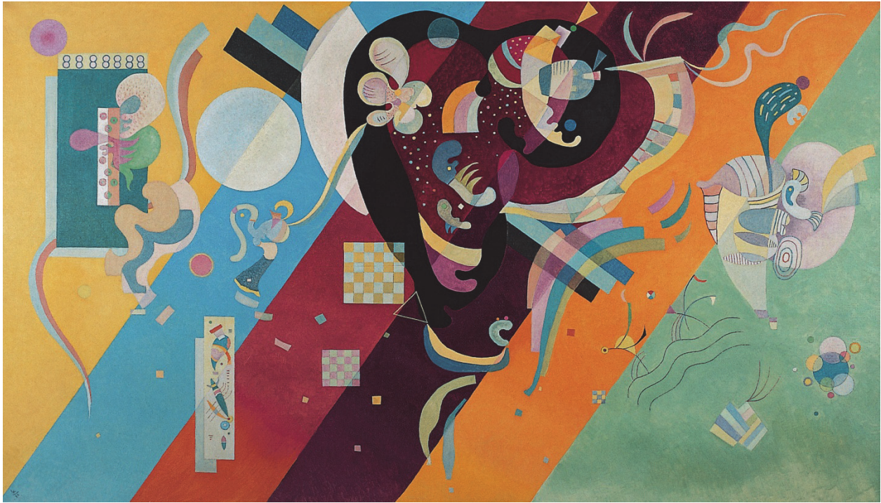
Figure 6. Wassily Kandinsky, Composition IX, 1936, oil on canvas, 113.5 x 195 cm, Paris, Centre Georges Pompidou, Musée national d'art moderne.