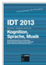
IDT 2013/2/2 Kognition, Sprache, Musik