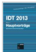
IDT 2013/1 Hauptvorträge