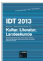
IDT 2013/3/1 Kultur, Literatur, Landeskunde