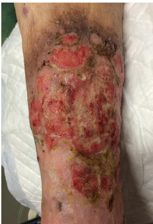
Figure 3. Clinical aspect of the lesions after one cycle of CVP.