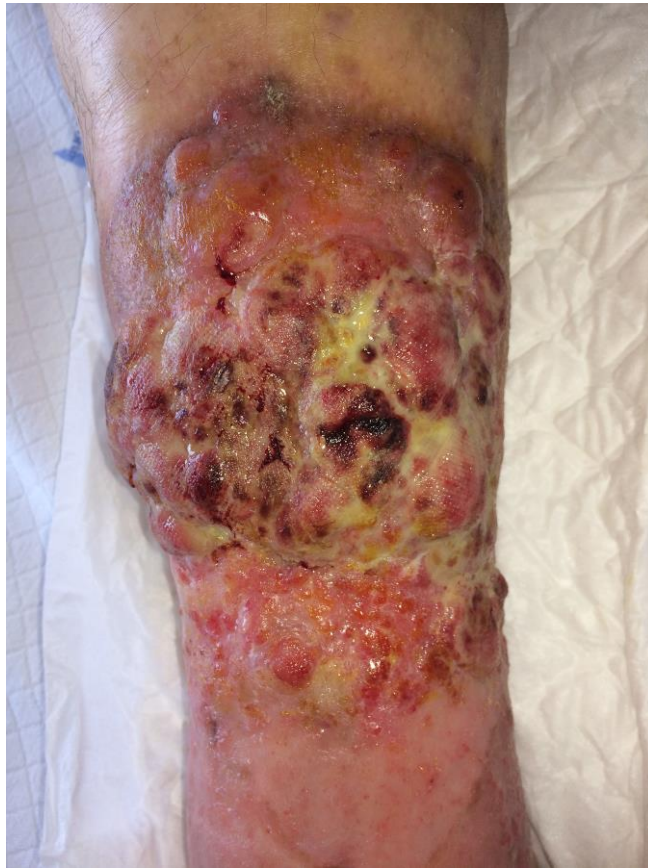
Figure 1. – Initial clinical aspect of the lesions.

On physical examination we observed multiple coalescent nodules forming a vegetating mass of 15x10cm in the right leg and a peripheral ill-defined erythematous plaque, with some associated bleeding and seropurulent discharge (Figure. 1). There were no systemic symptoms and the physical examination was otherwise normal.