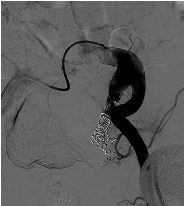
Fig. 1 - Internal iliac artery aneurysm embolization prior to EVAR.

IIA embolized with coils prior to EVAR (Figure 1) and another patient was treated with an iliac branch device (IBD); (Figura 2). Two patients underwent endovascular IIAA embolization with coils (bilaterally, in one case) without proximal coverage. One patient, who had undergone an abdominal aortic aneurysm (AAA) open repair 10 years earlier, with proximal ligation of the IAA due to a small aneurysm, presented with growth of his IIA and underwent percutaneous, ultrasound-guided, transgluteal, IIA embolization with coils (Figure 3).