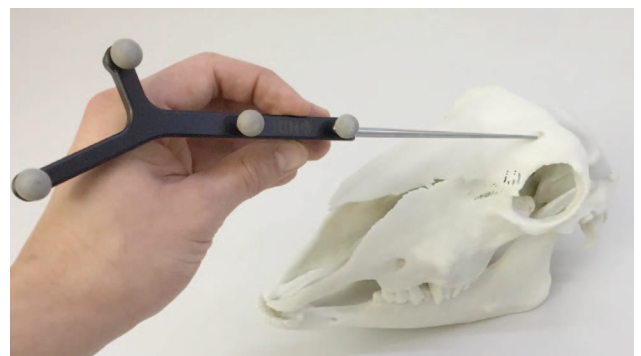
Fig. 2. Passive tool by NDI and the physical model.

Now that the preoperative landmarks are defined and the same points were collected from the physical model, it is possible to perform the point-to-point registration using the ‘Fiducial Registration Wizard’ module. The goal is to match the preoperative landmarks and the points collected intraoperatively. However, the transformation obtained is not sufficient to have a good result of the matching of both models (virtual and physical). The output of this module is the transformation matrix that can transform the landmarks chosen preoperatively into the points collected intraoperatively and to apply it to the model it is necessary to use the ‘Transforms’ module. As it was mentioned on the last section, this transformation as to be performed in a harden way and to do that, the ‘Models’ module is used.