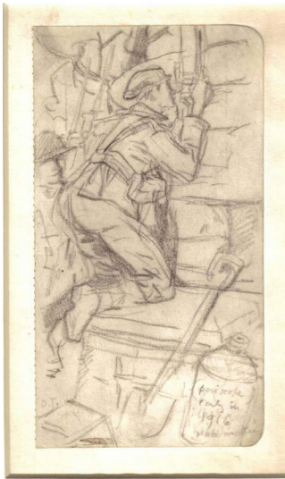
This sketch by David Jones is from the First World War Poetry Digital Archive, University of Oxford ( www.oucs.ox.ac.uk/ww1lit)

the war, recordings of music, and interviews with military officials.