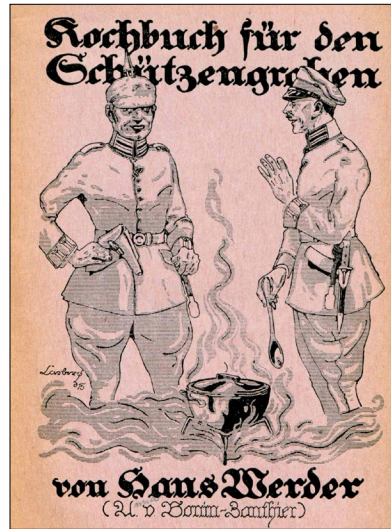
German battlefield cookbook from the British Library's collections

Among the German ephemera is a digitized version of a children's picture book from 1915 called Hurra! that tells the story of a little German boy named Willi and his Austrian friend, Franzl. Together, Willi and Franzl butcher French, English, Russian, and Serbian soldiers, securing success for their side. Another book aimed at German children was not meant for entertainment, but for schoolwork—a math book with war-based calculations for