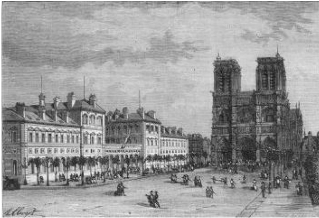
FIG. 2. Hotel Dieu in Paris, France, where Dupuytren would serve as Chief of Surgery for over 20 years.