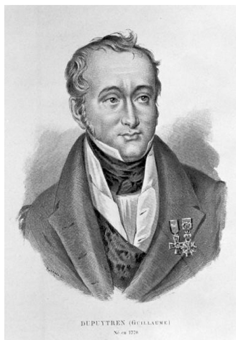
FIG. 1. Lithograph of Guillaume Dupuytren.

Although his peers and his students were able to look past his unprofessional behavior, his controversial actions toward his patients may have led Dr. Dupuytren