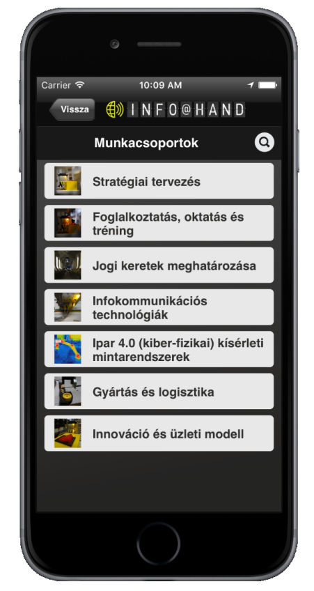
Fig.3. App to support the Working groups of the National Industry4.0 Technology Platform

In October 2016, the most urgent topics forced the establishment of the following seven working groups. MTA SZTAKI has also prepared an intelligent application that can run on several mobile platforms as well, as shown in figure 3.