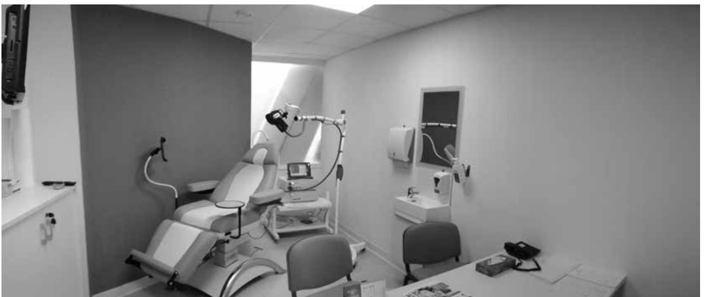
Figure 1: An image showing the set up of an rTMS Clinic in Malta

Other treatments like direct current stimulation, vagal nerve stimulation, and deep brain stimulation are also being actively investigated and researched. Deep brain stimulation in particular, which uses an H-shaped coil as opposed to a standard figure of eight coil, is emerging as a promising “close second” to rTMS. This was indicated in a recent multi-centre randomised control study, which concluded that the effects appear “durable”, and a “clinically significant improvement” was seen in patients resistant to multiple antidepressants (Levkovitz et al., 2015). A further recent analysis corroborated these findings (Hardy et al., 2016).