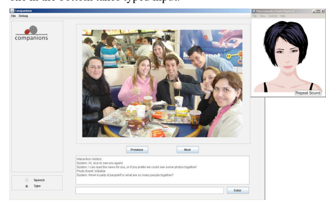
Figure 1: Senior Companion Screenshot

uppermost shows the history of the user interaction so far, and the one in the bottom takes typed input.