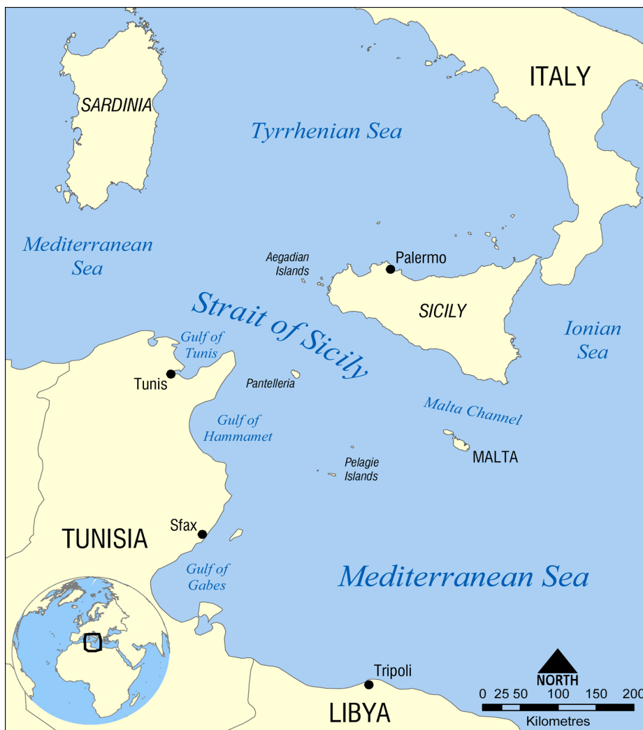
Figure 3 - The Sicilian Archipelago. (© 2014. Wikipedia. Retrieved from: http://upload.wikimedia.org/wikipedia/commons/thumb/d/da/Strait_of_Sicily_map.png/250px-Strait_of_Sicily_map.png - July 27th 2015).

rule on the island. The division between Palermo and the west of the island, and the cities of Messina, Syracuse and Catania on the east, already evident then, has persisted through the ages (Romano, 2008).