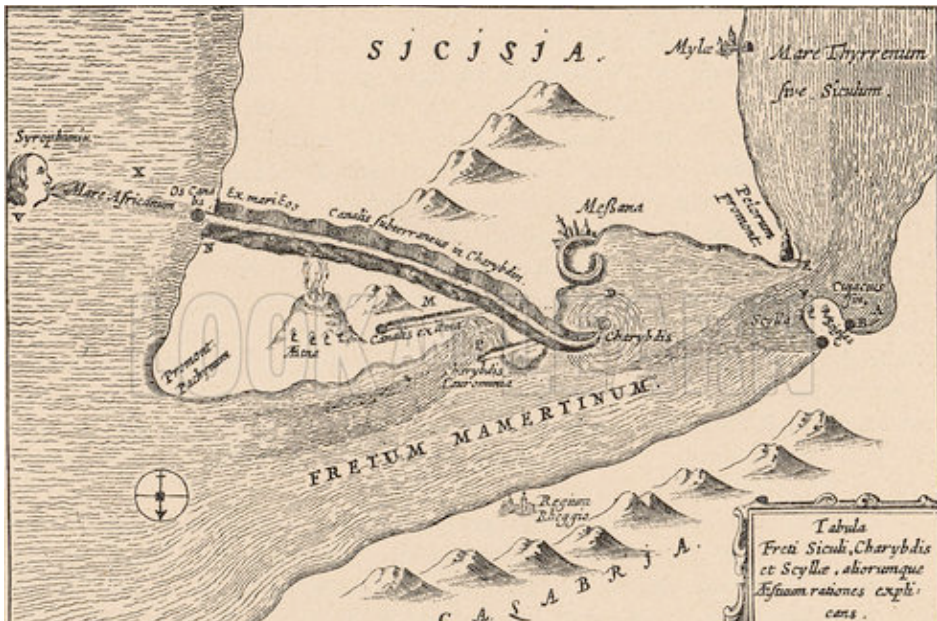
Figure 2: The Straits of Messina, showing location of Scylla and Charybdis, from a 1665 map. The Etna Volcano is also visible. Legend (in French) reads: Charybdis and Scylla in the Messina Straits (North is towards the bottom of the image.)

watery medium, infecting the mainland; thus justifying mainland invasions (which, however, are not always successful).