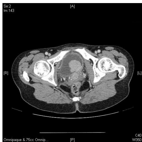
Figure 3: CT showing local recurrence of disease

Repeat fludeoxyglucose PET scanning this time showed multiple metastases to liver and lung (Figure 4), consequently ifosfamide and epirubicin chemotherapy was commenced.