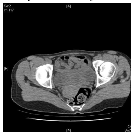
Figure 1: well-defined, lobulated soft tissue mass at the left vesicoureteric junction.

At cystoscopy, a soft tissue mass originating from the left distal ureter and involving the bladder wall in the vicinity of the ureteric orifice was resected and the left ureter was stented with a double J stent. An initial diagnosis of high grade urothelial carcinoma involving the muscle wall (pT2G3 WHO classification 1973) was made on histological examination of the resected tissue. A positron emission tomography scan using fludeoxyglucose tracer did not show any regional or distant metastases. Because of the exceedingly rare incidence of these tumours, a specific staging system for sarcomas of the ureter does not exist and the TNM staging for transitional cell carcinoma of the ureter is used as published by the American