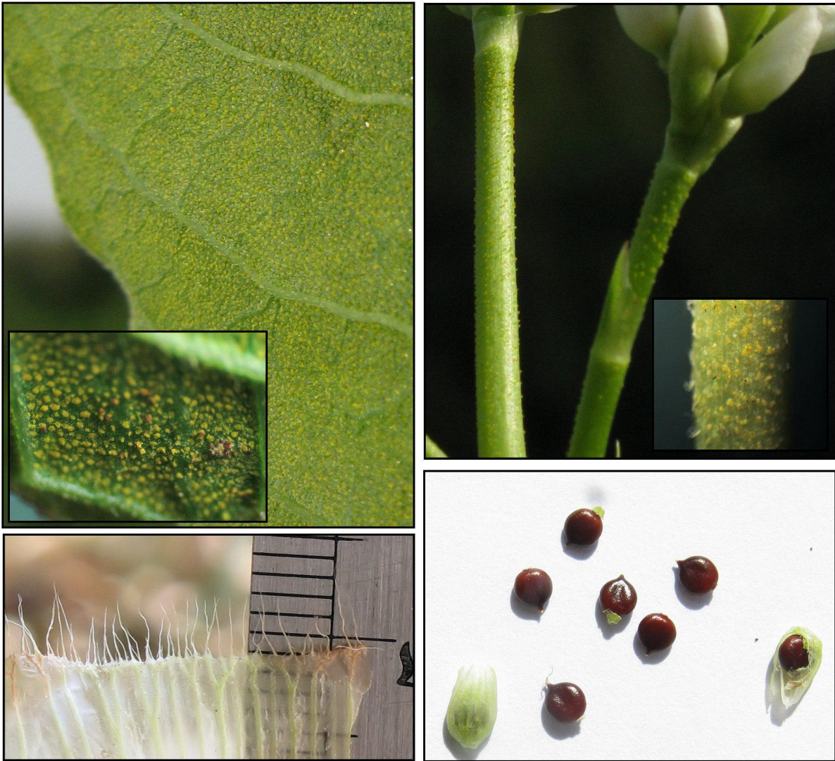
Figure 3: Morphological characters of Persicaria senegalensis forma senegalensis found in specimens on the Maltese Islands. Top left: Abaxial surface of leaf lamina from [PSN2] which is glabrous and covered with many sessile yellow glands, magnified at x40 in the inset. Top right: Peduncles from [PSN1] showing numerous yellow glands, magnified at x40 in the inset. Bottom left: ochreae from [PSN3] having 2mm long cilia at the apical margin; Bottom right: Nuts from [PSN2] some with dimpled faces.