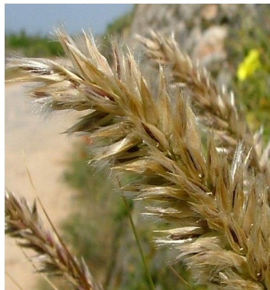
Figure 11: Spikelets of Melica ciliata