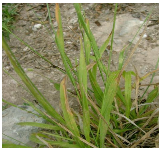
Figure 14: The bright green leaves.

Pennisetum villosum R. Br. (Fam. Poaceae) - While walking a trail between Xemxija and Mizieb on the 5 January 2008, an unfamiliar grass was sighted growing by the side. The flowers were very showy, whitish, plume-like, and the spikelets had tufts of silky hairs. After close inspection of the spikelets, the plant was later identified as