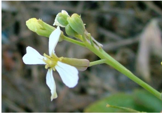
Figure 1: Flower of Brassica tournefortii