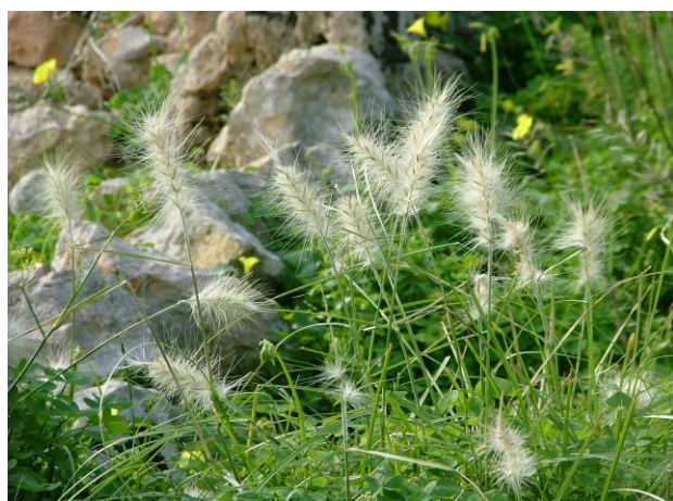
Figure 15: Pennisetum villosum growing wild at Xemxija