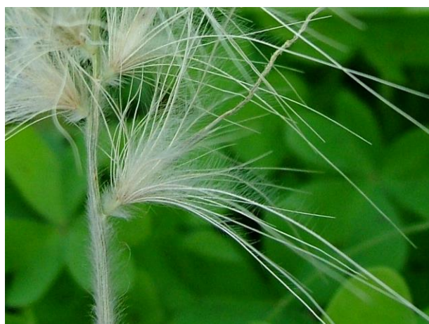
Figure 16: Spikelet showing silky hairs