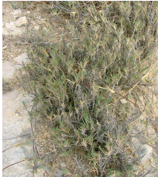
Figure 9: Aeluropus lagopoides covering a whole patch.

Mediterranean, the Maltese plants are very important especially from a conservation point of view.