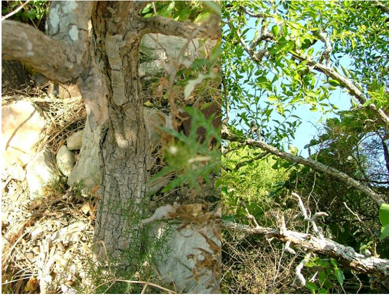
Figure 4: Ziziphus zizyphus at Wied l-Speranza, Mosta, May 2006.