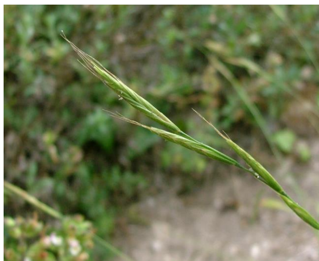
Figure 13: Spikelets with long awns.