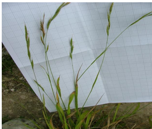
Figure 12: Brachypodium sylvaticum plant at Bingemma, Malta.

Brachypodium sylvaticum (Hudson) Beauv. (Fam. Poaceae) – Brachypodium sylvaticum (Hudson) Beauv. is an uncommon grass species ( Poaceae ) in the Maltese Islands inhabiting shady places including valleys and wooded areas. Both Haslam et al. (1977) and Borg (1927) describe it as rather rare in shady places in a few sites in Malta and Gozo (though Borg mentions that it is more frequent in Gozo). In its native range, Brachypodium sylvaticum is most commonly found in forests and woodlands, but may also occur in open habitats (Tutin et al. , 1980). Recent records of Brachypodium sylvaticum come from Tabone (2008). On the 16 June 2009 some plants of Brachypodium sylvaticum were found at Bingemma, Malta growing among other vegetation including Erica multiflora L., Lonicera implexa Aiton and Pinus halepensis Miller in a mostly maquis habitat. The bright green to yellowish-green leaves were rather conspicuous, as were the relatively long awns on the narrow spikelets. The species seems to be more or less frequent here and it can be said that a small and healthy population (that might be bigger than expected) of this plant occurs at Bingemma. All the records available for this species suggest that the plant seems to be well established in the Maltese Islands. The species is native in Europe including the Mediterranean (Haslam et al. , 1977)