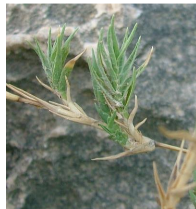
Figure 7: The leaves are small and pointed, folded and with white hairs.