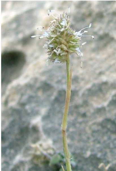
Figure 8: Inflorescence- a dense spike-like panicle of ground, Dwejra, Gozo.

very arid places especially salt-impregnated soils (Flora of Pakistan). Given the species' rarity and range in the