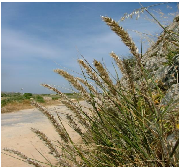
Figure 10: Melica ciliata growing out of a rubble wall limits of Mgarr, Malta.

Melica ciliata L. (Fam. Poaceae) – Melica ciliata L. is not common in the Maltese Islands. It is recorded by Tabone (2007) in his list of rare vascular species from Wied il-Hesri, and by Haslam et al. (1977) as not frequent in arid rocky places and valleys in a few sites in Malta and Gozo. Borg (1927) also mentions it from Comino “in several places”. On the 29 April 2008 a Melica ciliata was noticed growing from a rubble wall in the limits of Mgarr, Malta. This rubble wall formed part of the walls surrounding arable fields. The plant was growing on the outside, facing a secondary road. Records available to the author do not include Mgarr, Malta, and this locality should be included for this species if it is not yet listed from here. Melica ciliata is reported as common in Corsica and throughout Italy including Sardinian and Sicily (Pignatti, 2002). The species' native range is widespread in Europe, including in the north as far as Finland, middle, eastern and south western countries, and also occurs in Asia (GRIN).