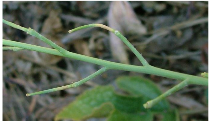
Figure 2: Young fruits showing conspicuous beaks.