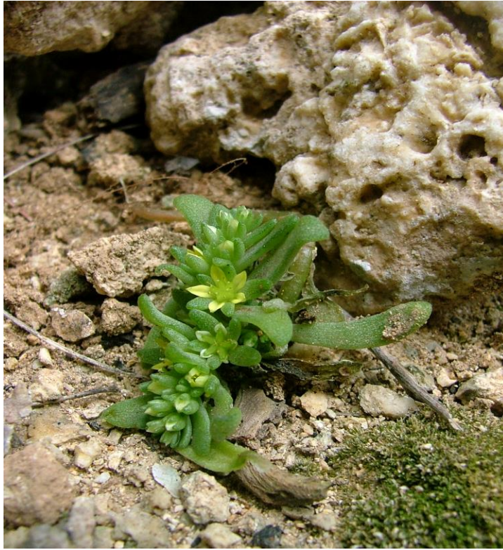
Figure 3: Sedum litoreum at Rdum id-Delli, mid-April 2009.

Ziziphus zizyphus (L.) Meikle (Fam. Rhamnaceae) - Ziziphus zizyphus (L.) Meikle ( Ziziphus jujuba Miller) is not native to the Maltese Islands. It is not common and it was formerly cultivated for its edible fruits and according to Borg (1927) the species “naturalizes in many old gardens and valleys in Malta and Gozo, but reproduces itself mostly by suckers”. The Jujube grows into a shrub or a small tree and is armed with spiny stipules.