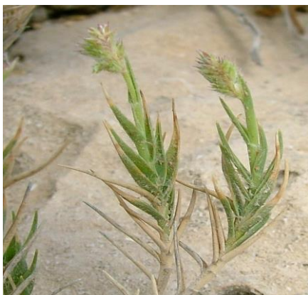
Figure 6: Aeluropus lagopoides leaves and inflorescence.

Aeluropus lagopoides (L.) Trin. (Fam. Poaceae) - Aeluropus lagopoides (L.) Trin. is a rare grass for the Maltese Islands. It was first discovered by Silverwood at Qalet Marku, and afterwards by Wolseley at Dwejra, Gozo. The Qalet Marku plants have gone extinct as a result of development, while the Dwejra (Gozo) population has not been seen for several years (Lanfranco, 1989). On the 7 June 2008 Aeluropus lagopoides was seen at Dwejra, Gozo thus re-confirming early records of the species at this locality. The plants were growing in a patch of rocky ground close to the sea. Accompanying plants included Lotus cytisoides L., Capparis orientalis Veillard. and Helichrysum melitense (Pignatti) Brullo, Lanfranco, Pavone & Ronsisvalle. This grass has stolons running over the ground, small distichous leaves and a dense spike-like terminal inflorescence. The habit, leaves and the inflorescence were particularly important features for the author to notice this plant while photographing flora in the area. Such a small and lone population is vulnerable especially given its locality in a coastal and popular place and is at risk from any kind of disturbance or habitat alteration. Aeluropus lagopoides also occurs in Sicily and Lampedusa and is very rare (Pignatti, 2002). Its range in Europe is only given in Sicily (GRIN). Its range is Sicily and Cyprus through the Middle East to Central Asia and India, Pakistan, and North Africa from Morocco to Somalia and is described as a plant of