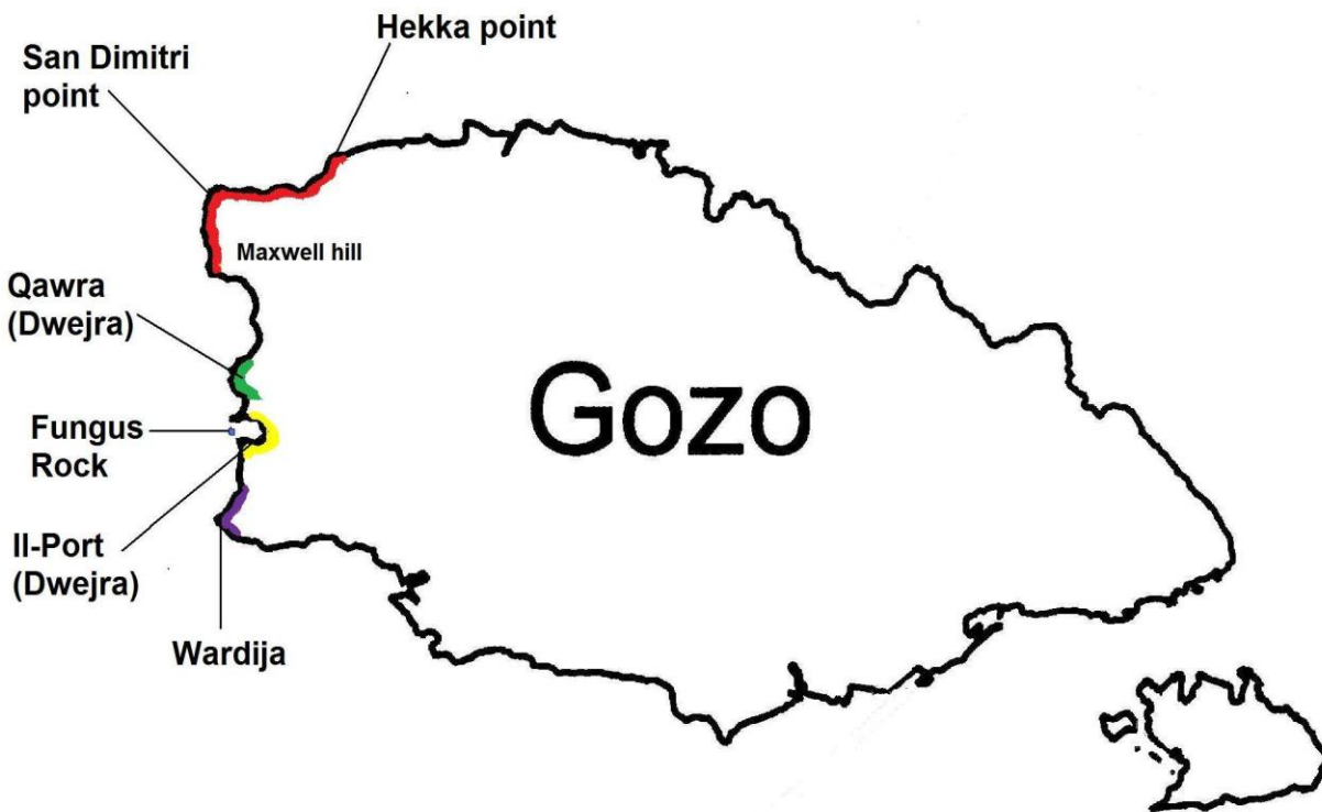
Figure 1: Present and past distribution of Helichrysum melitense in Gozo. Legend: 1) Yellow marking represents the Il –Port population; 2) Red marking represents the newly described and discovered sites of the species in Gozo by the authors. This is the northwest population; 3) Green marking represents the Qawra or Inland sea population; 4) Violet marking represents the Wardija population.