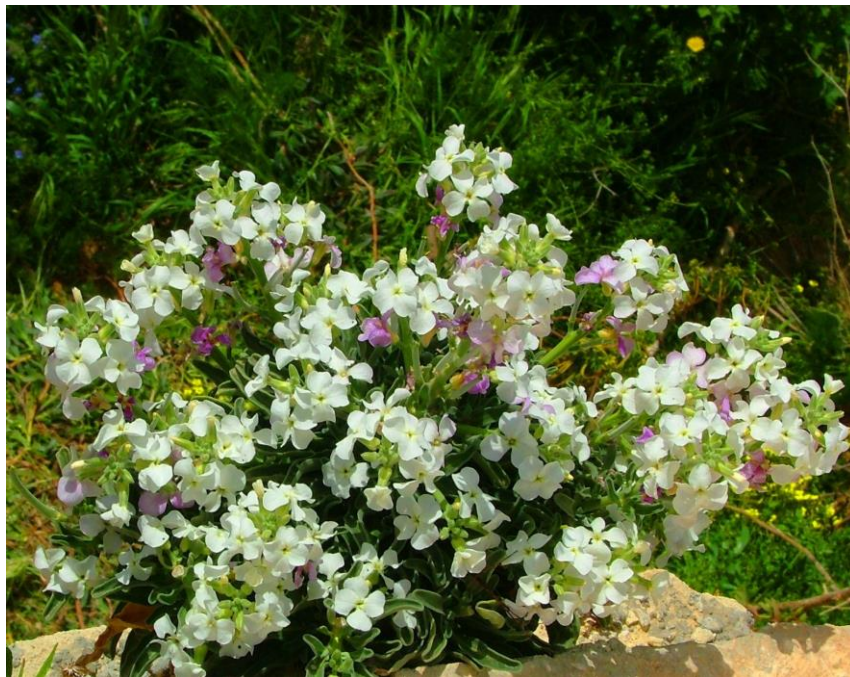
Figure 5: A white flowering specimen of Matthiola incana subsp. melitensis at Xlendi, 1 i / 2003.