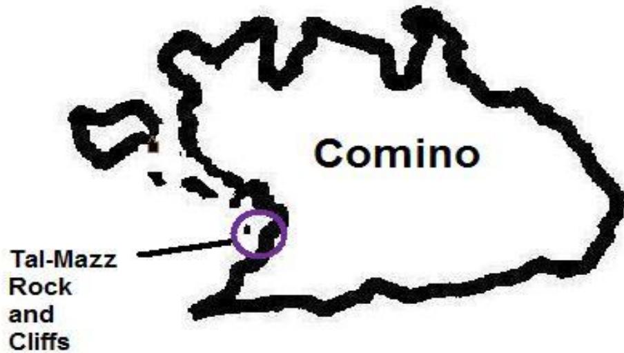
Figure 4: Map of Comino and surrounding islets, showing location of sites where Matthiola incana subsp. melitensis was recorded.

additional Matthiola incana ssp incana individuals were observed in the vicinity, to suggest a possible hybridization between the two subspecies. This is the first record of Matthiola incana subsp. meiltensis exhibiting white flowers.