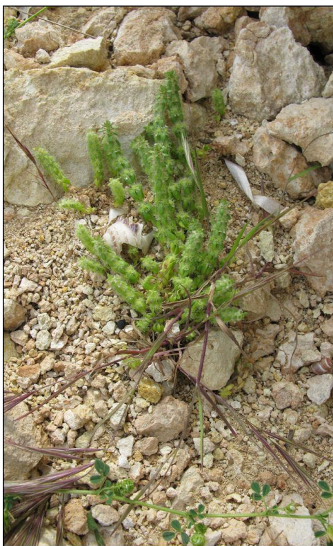
Figure 1: Habitat and habit of Valantia hispida , Xatt l-Ahmar, Gozo (Malta)