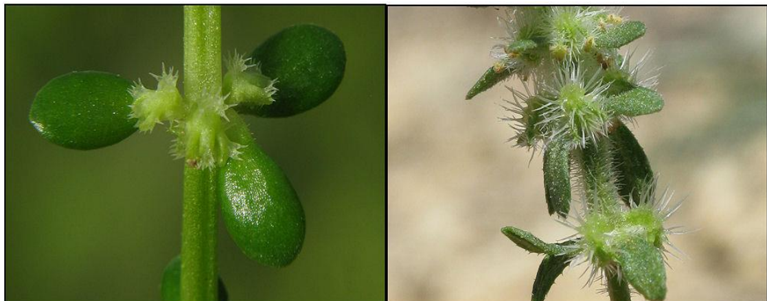
Figure 3: Comparison of the fructiferous body of Valantia muralis (left) and V. hispida