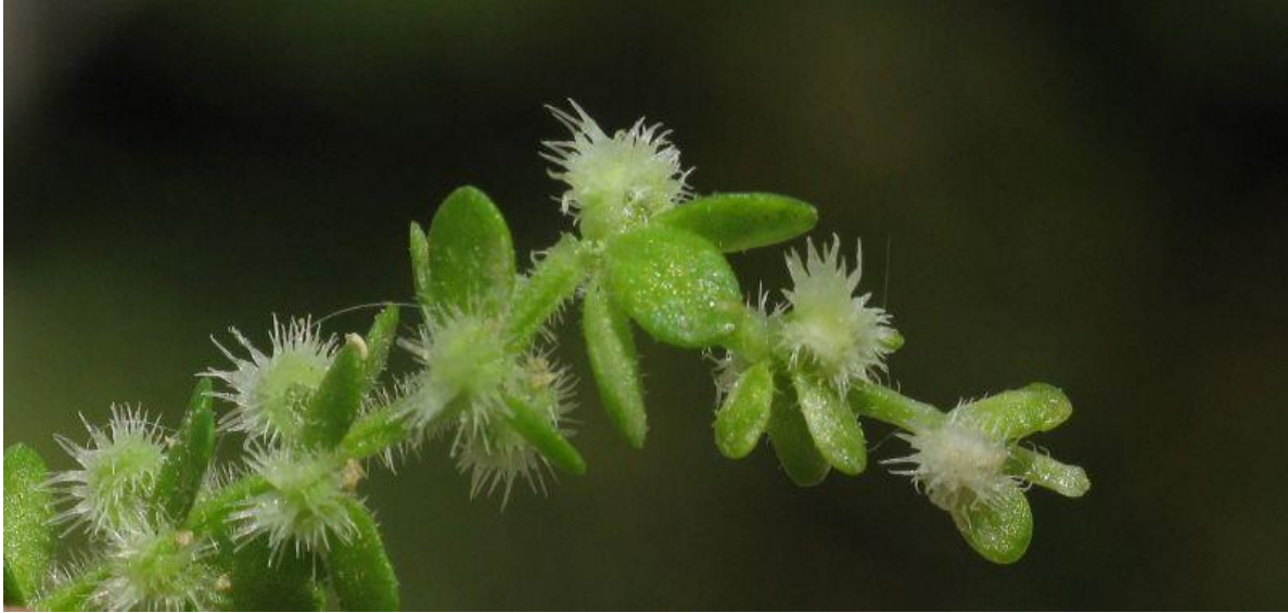
Figure 6: V. muralis var. hirsuta Gussone found on Mistra Rocks, Gozo with long and numerous bristles and a dorsal cornule (total 4 cornules) in its fructiferous body.