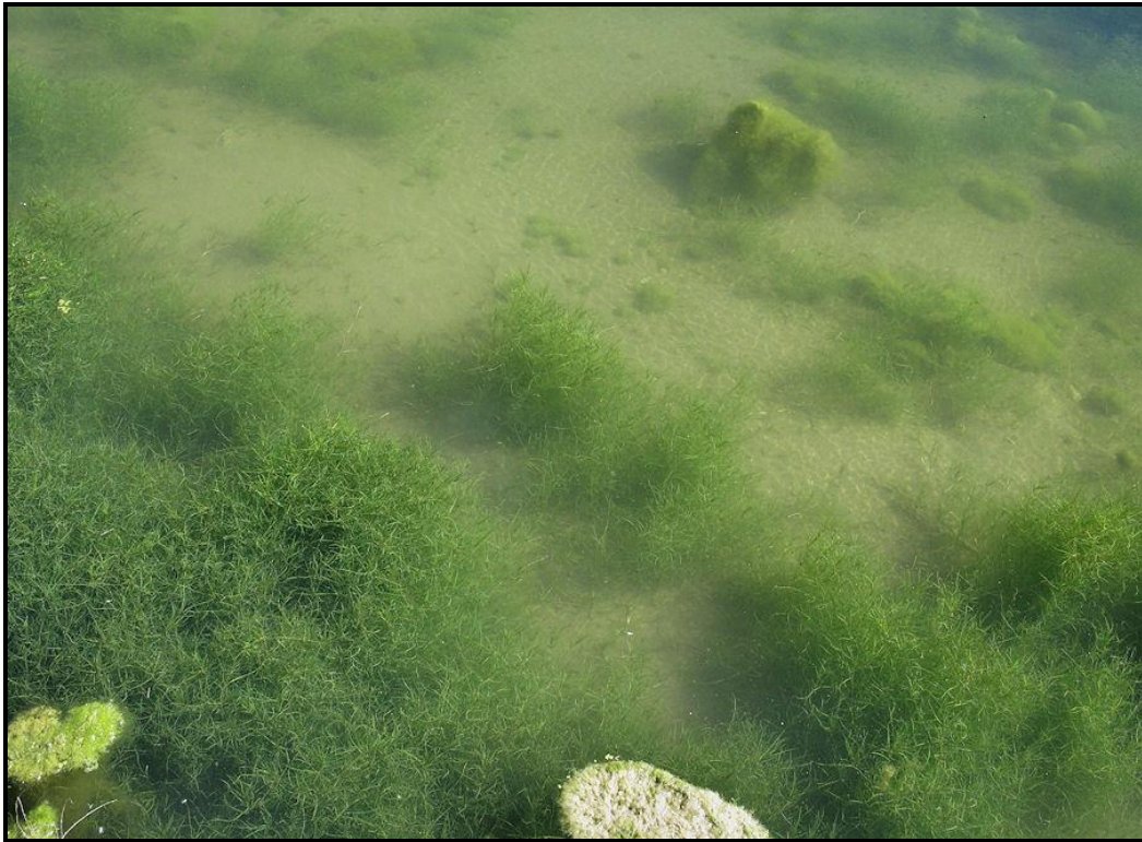
Figure 1: Habit and habitat of Zannichellia major submerged in pond at Fiddien, Malta (28 Feb 2008.)