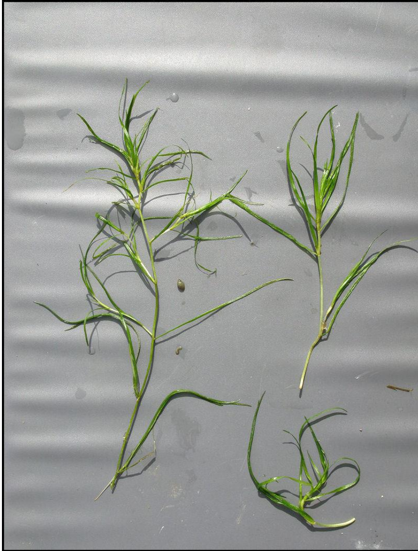
Figure 3: Upper part of Zannichellia major showing its wide leaves