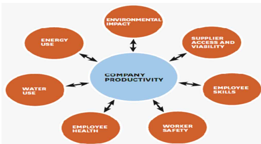
Figure 2. The connection between competitive advantage and social issues.

Creating shared value (CSV) is about embedding sustainability and CSR into a brand’s portfolio. All business processes in the value chain (Porter, 1986) operate in an environmental setting within their wider community context. Porter and Kramer (2011) held that this new approach sets out new business opportunities as it creates new markets; it improves profitability and strengthens the competitive positioning. Crane and Matten (Crane and Matten blog, 2011) admitted that Porter and Kramer (2011) have once again managed to draw the corporate responsibility issues into the corporate boardrooms. Crane and Matten (Crane and Matten blog, 2011) had words of praise for the “shared value” approach as they described the term as compelling and endearingly positive. Recently, Elkington (2012) argued that sustainability should not be consigned to history by shared value. The author recognised that Porter and Kramer’s shared value proposition is undeniably a key step forward in corporate strategy. Yet he maintained that shared value can play a key role in destroying key resources, reducing the planet’s biodiversity and destabilising the climate. Then he went on to say that Porter reduced corporate sustainability to resource efficiency. Elkington reiterated that sustainability focused on the idea of intergenerational