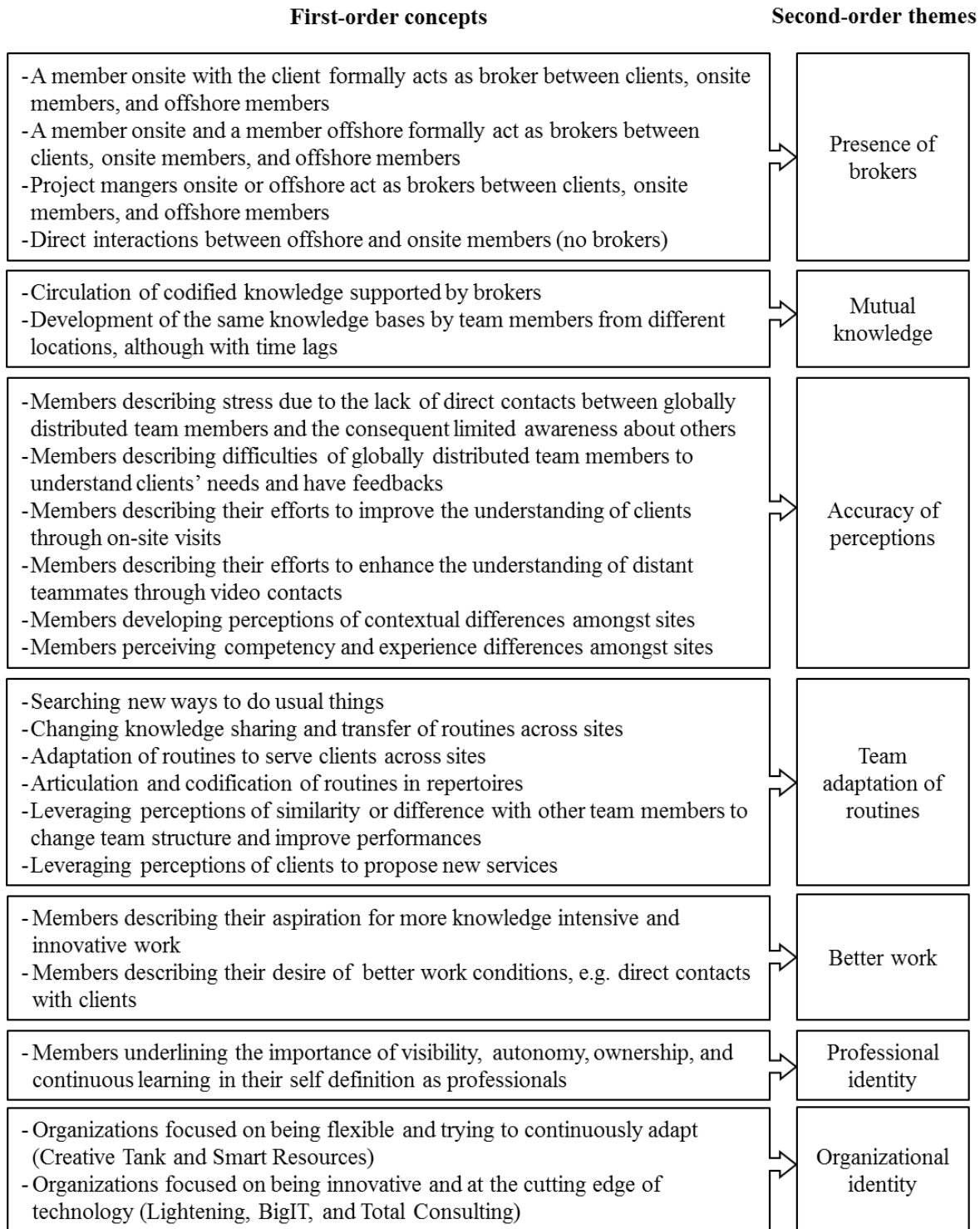
Figure 1: Data structure