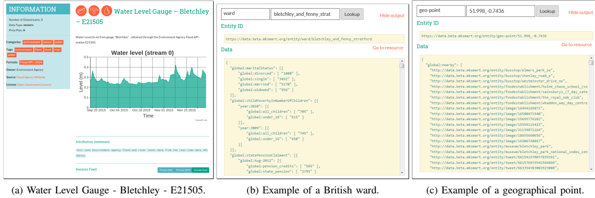
Fig. 1: MK:Smart Data Hub

sources that have different usage policies. This makes the exploitation of the data problematic.