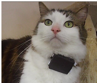
Figure 2. Tags attached on the participant slipped under his chin. They were covered with black rubbery tape to record biting marks.

It is also shown how the time the cat spent grooming, biting and scratching increased with the increasing obtrusion of the devices. In particular, biting the device, scratching in proximity of the neck, and head shaking increased with the activity monitor and even more with the GPS, showing a disturbance possibly due to both the method of attachment and the device.