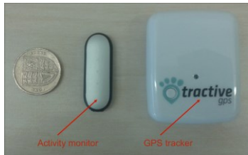
Figure 1. Tested devices were