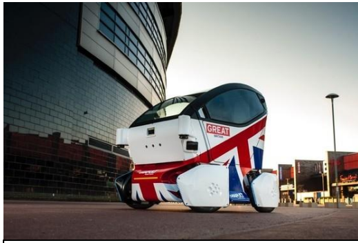
Figure 4 The Milton Keynes two-seater pod

Outside of sheltered contexts, PRT systems are only being applied gradually. However the prospect is now emerging of autonomous PRT systems that do not require segregated tracks. Autonomous cars are already test running on streets in the USA and became street legal in the UK from 2015. The