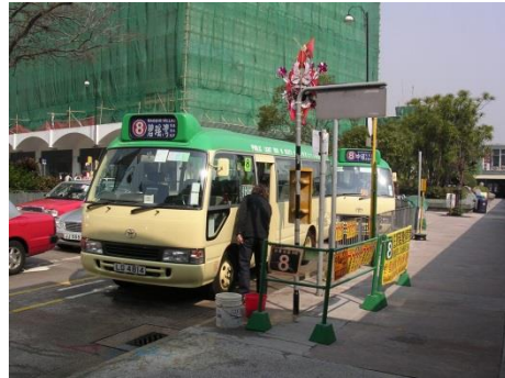
Figure 1: A public light bus in Hong Kong

These typically run from a main terminus point only when the vehicle is full, but otherwise cruise the route in order to solicit custom (Enoch, 2003). Similar paratransit services of relatively high capacity operated by taxis and/or minibuses also operate in countries as diverse as (limited areas in) the USA (jitneys); Russia (marshrutka), Kenya (matatu), Turkey (dolmus), Northern Ireland (black taxibuses), Hong Kong (public light buses), Philippines (jeepneys) and Tunisia (louage). Slightly different, the Helsinki 'Kutsuplus' uses a 9 seater minibus that can be