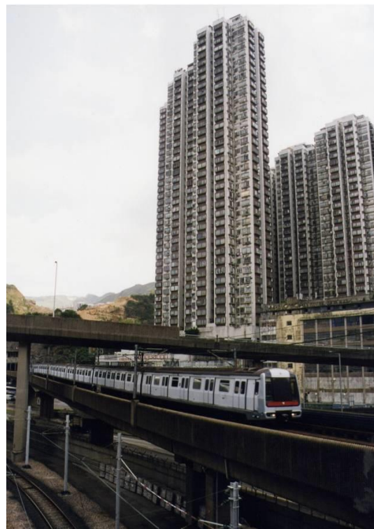
Figure 2 Hong Kong Metro and high density living

The design of transport for sustainable cities is therefore structured around concepts to ensure dense clusters that can support high-capacity, corridor-based public transport. This is seen as the ideal urban transport/land-use pattern to constrain car use – intended to get people to arrange their habitat and lives around the service design requirements of a transport system (Figure 2). Planning controls are advocated to produce settlement patterns and conditions that will favour high-capacity, corridor-based public transport and discourage car use. High densities also bring more destinations within walking and cycling distance. Such an approach advocate high density cities structured around public transport systems to reduce car use (Newman and Kenworthy, 1999). In a comprehensive review of this and other approaches, Banister (2005, Chapter 6) cites case studies of cities that have achieved a 10% cut in car use through approaches utilising planning controls and public transport development.