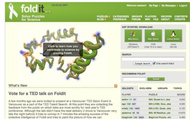
Figure 1: Foldit homepage ( http://fold.it/portal/ )

forum and chat tools. Leaderboards are used to rank players according to their scores.