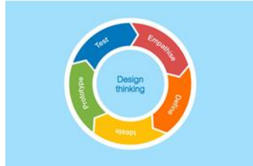
Fig 1. Stages of the Design Thinking Process, adapted from Stanford Design Program and the Standard Arts Institute [29]

Weeks 3 and 4 introduce learners to a wide variety of smart city initiatives and is focused on the ideate stage of the design thinking process. They explore the role of smart infrastructure and sensors in cities, learn about the role of data, debate the challenges of privacy and security, and look the smart city market, finance and also consider the data economy, civic hacking and digital social innovation.