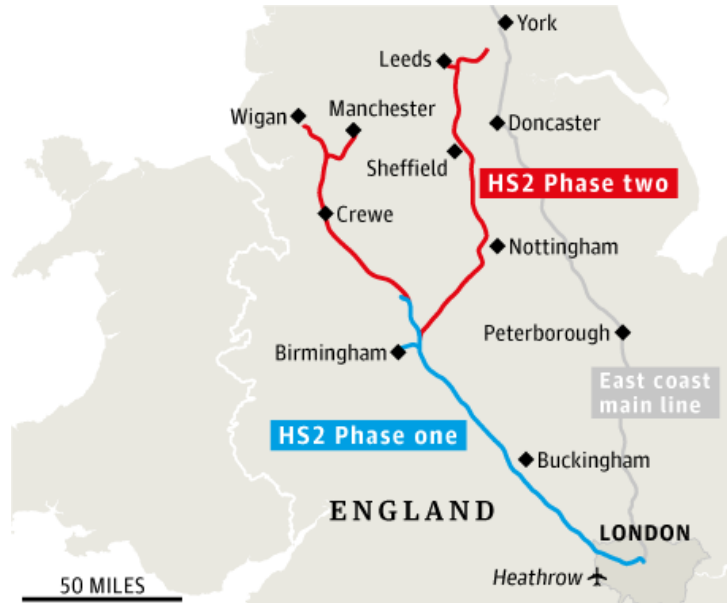
Figure 2 The route of HS2

Design as analysis: examining the use of precedents in parliamentary debate.