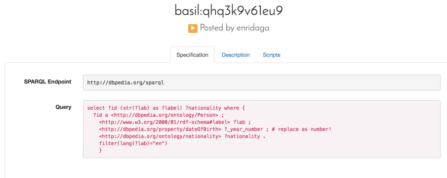
Fig. 1: A query as appears in the BASIL environment.

The design of the BASIL follows a specific philosophy: to minimise the learning curve for the users in order to foster its adoption. To reach this objective, BASIL (i) is modelled to be as simple as possible, (ii) is designed by using well-know Web API practices and (iii) minimises the introduction of new formalisms. The architecture of BASIL is provided in figure 2. The BASIL platform plays the role of a mediator between SPARQL endpoints and developer’s applications. By submitting a SPARQL query and an endpoint to BASIL, a developer generates a Web API. Figure 1 shows an example, that is also reachable at http://basil.kmi.open.ac.uk/basil/qhq3k9v61eu9 .