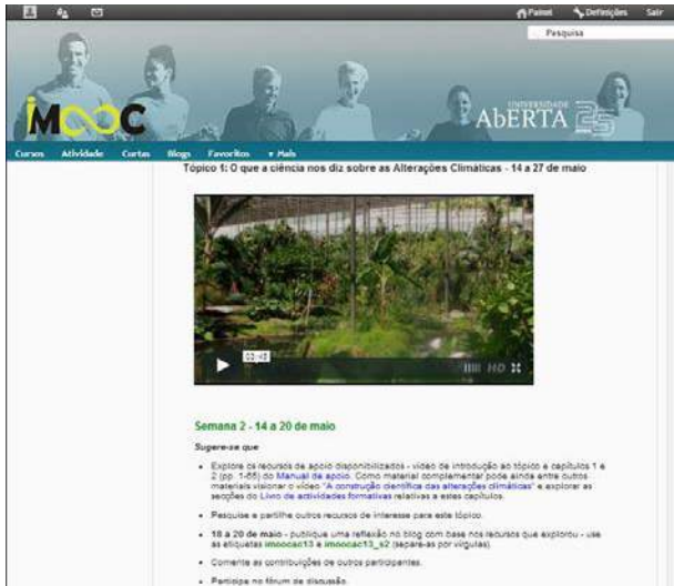
Fig. 2. Page from the "As alterações climáticas - or contexto das experiências de vida" course from UAb iMOOC

The Universidade Aberta has developed its UAb iMOOC environment “Fig. 2” through the integration of two software platforms: Moodle (development of on-line courses) and Elgg (training of communities of users). Instead of relying on the personal learning environments of the participants in the social context, the selection has been the use of Elgg, a platform of open source social networks totally integrated with Moodle by means of a single system to begin the session. Moodle (in version 2.4) is used to centralise the main information on the content, the resources, the suggested activities, timetable, etc. and it also houses the discussion forums. Elgg is a platform of open source social network services, which facilitates the training of communities, the work on the network with the exchange of archives and the collection of news via content aggregators. Everything may be shared between users, using access controls and can be catalogued by means of labels. It has a variety of web 2.0 tools and social network functionalities, enriched profiles, micro blogging, blogs, social markers, photo and video editing, recommendation systems, wiki-like pages, etc.