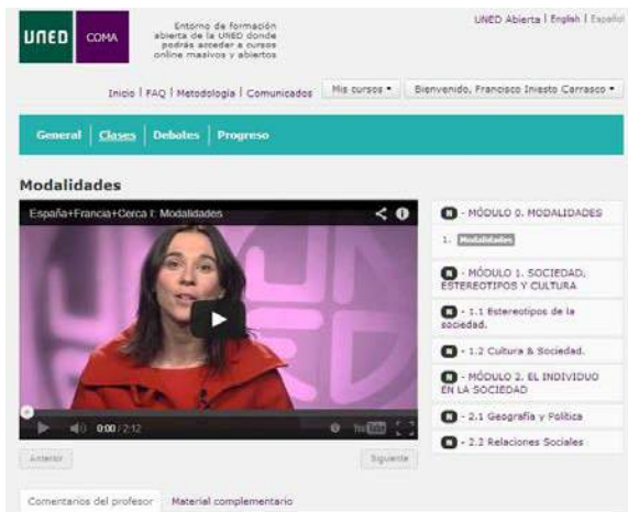
Fig. 1. Page from the "Estado del course Spain+Francia+Cerca I " course from UNED COMA