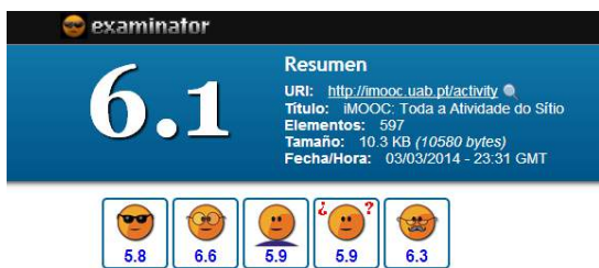
Fig. 3. Use of eXaminator in a page from the "As alterações climáticas - o contexto das experiências de vida" course from UAb iMOOC

This tool provided different scales to the set of tests carried out, with those points that have been applied in a correct and regular way being considered as excellent, bad and very bad to those which have accessibility problems according to the guidelines, the final offers a score calculated as a weighted scale. The results can be seen in Table I.