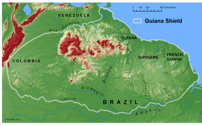
Fig. 2. Map of the Guiana Shield, South America (kindly drawn by Sarvison 2010).

and including parts of the watersheds of the Orinoco and Amazon rivers (Hammond 2005). With its valuable fresh water reserves, low deforestation rates, and rich biodiversity, it has been the focus of considerable conservation efforts, payment for ecosystem services (PES) schemes, and climate change mitigation and adaptation financing (Mistry et al. 2009, Berardi et al. 2013b). Brazil, for example, has formally protected vast areas of the Amazon region, either as biodiversity conservation areas or indigenous territories. However, Brazil is also the world's fourth largest emitter of greenhouse gases, with a significant contribution from deforestation in the Amazon basin (Matthews et al. 2014). After years of decreasing deforestation rates, recent data show that deforestation is sharply on the increase (BBC 2013). Brazil has also made significant discoveries of offshore fossil fuel deposits that could make it one of the largest oil producers in the world. This ambiguous position on the world stage, on one side as a nation that strives to conserve and protect natural ecosystems and indigenous cultures, and on the other, as an increasingly significant global emitter of greenhouse gases, means that its international and national policies are often working against each other (Bond et al. 2009).