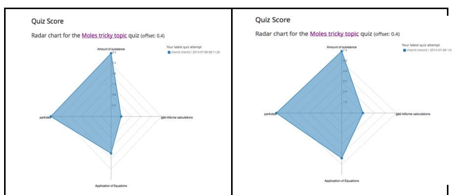
Fig. 4. Before & After Radar Chart Quiz Visualisation UKRad2 (Chem3) 2

where the gaps in knowledge are, and where any changes in understanding has occurred as the student works through the JuxtaLearn learning activities (see Figure 4). Because the questions are linked to the stumbling blocks, with simple questions linked to only one stumbling block and more complex questions linked to several stumbling blocks (see Figure 3), the visualisation gives a good indication of the levels of understanding and is easier to interpret for both students and teachers. Figure 4 shows the before and after visualisations for chemistry student Chem3. The before quiz visualisation shows a surface (poor) understanding of gas volume calculations and application of equations . The ‘after’ the juxtalearn intervention visualisation shows that the student improved after focusing their learning on these weaker areas, developing a deeper understanding of the concept.