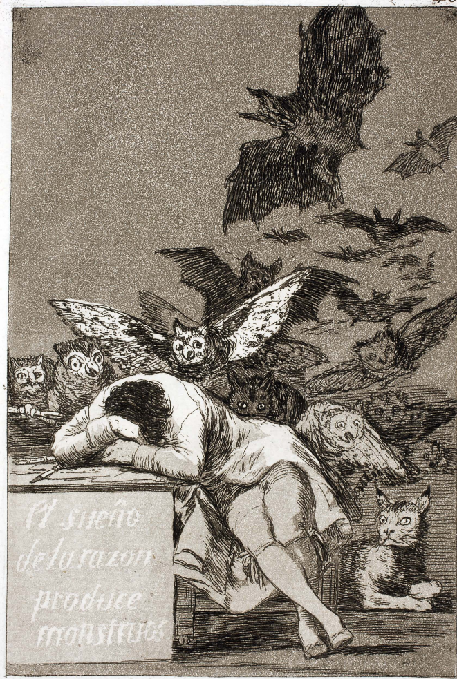
Figure 2: Francisco Goya: 'The Sleep of Reason' produces monsters ( http://en.wikipedia.org/wiki/The_Sleep_of_Reason_Produces_Monsters )

The power struggle for a more rational approach to knowledge generation is beautifully expressed in Goya's 'Sleep of Reason', which warns the viewer that a loss of reason inevitably results in chaos, irrationality and terror (see Figure 2).