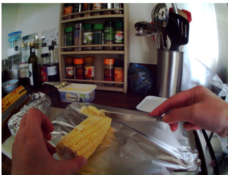
Figure 4 – Food Behaviour: Autographer Image

triggered by people entering the room and network logging was always on.