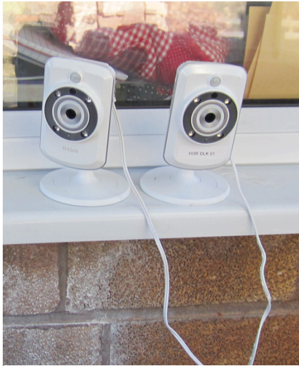
Figure 1 - IP Cameras setup in the household

Researcher time, privacy concerns, and a lack of capacity to reliably capture behaviours of interest mean that many existing studies of home behaviour rely upon self-reporting methods. However these have methodological concerns that could be ameliorated by the development of approaches that capture additional forms of data [1,4]. Both of the methods discussed in this paper primarily focus on visual data capture in the home, which due to its richness can be considered particularly sensitive [6]. Study participants are also likely to have pre-existing understandings and positions towards video surveillance, particularly given the rise of reality TV and 'fly-on-the-wall' documentaries [3].