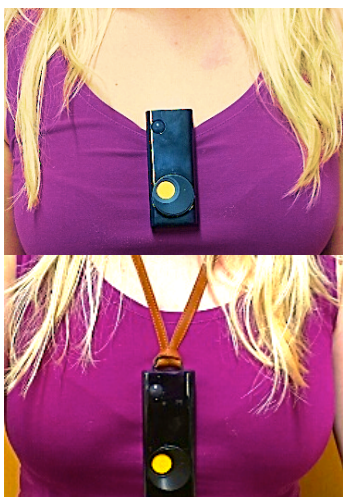
Figure 3 - Autographer clipped on (top) and with a neck strap (bottom). Yellow shutter is closed in both.