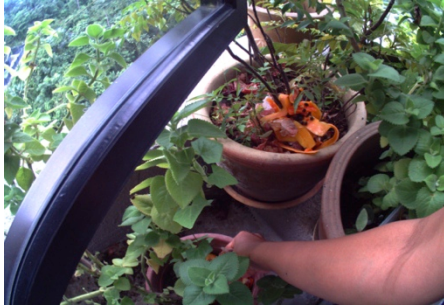
Figure 5 - Example of wider context of food practices. Here a participant is using food waste in their garden.

home, others only felt compelled to wear the camera when cooking and eating. However, the research team were also interested in the wider context of cooking and eating practices, such as exposure to information about food, the use of shopping lists and recipes, or unexpected uses of food waste (Fig 5). Thus some data sets yielded more insights than others.