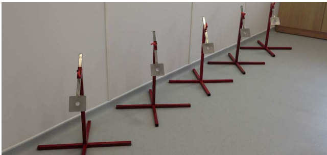
Figure 2. Stand line-up. The samples are suspended on individual stands.