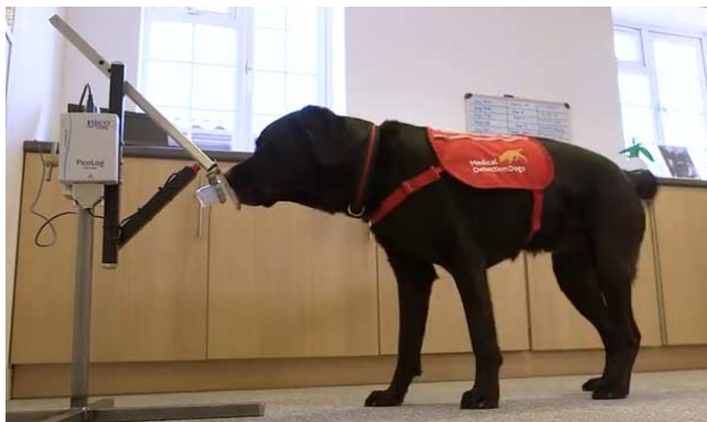
Figure 3. Cancer detection rig: the sensor is visible (in red) behind the base of the pivoted arm, above the sample.

which was connected to the plate holding the sample was pivoted at the top of the frame; at the bottom, another arm was fixed at an angle securing a pressure sensor on which the first arm rested against the spring within the sensor (LM10/3M29). The sensor was a conductive polymer potentiometer that changed resistance in proportion to the movement of the shaft; it was connected to a Picolog 1216 sixteen-channel data logger, so using Pico's proprietary software the movement and its duration could be graphically represented. When the dogs sniffed the samples, touching the metal plate with their nose and/or tongue, the pressure they put on the plate while investigating the sample could thus be recorded and represented. Our assumption was that the degree and duration of this pressure, together with the resulting patterns, might be considered a measure of the dogs' interest in the sample being tested. We hypothesized a correlation between the characteristics of the graphs produced by the dogs' detection activity and the stimulus coming from the sample.