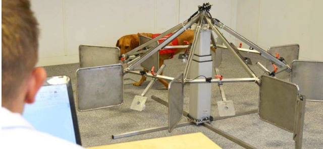
Figure 1. Carousel. The samples are suspended between metal screens preventing volatiles from traveling between positions.

describe cancer detection training practices and present the team's shared understanding of existing communication challenges between dogs and trainers. This defines our design space, based on the participant observations and records made by the researcher, and on the experience and records kept by the head of training and the CEO. Records include notes, photographs, videos and sensor recordings.