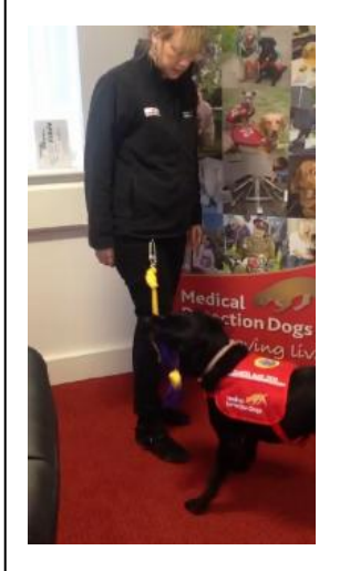
Figure 2. Pulling on the interface until it the 'tuggy' detaches will trigger alarm software.

variety of different tasks, including opening doors, helping load washing machines, retrieving fallen items, and even using ATM machines. I am investigating the potential of technologies that can support these dogs and others like them in their task of looking after their owner and exploring how specific designs might be able to help. In developing such technologies, my work seeks to explore the following research questions: