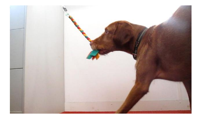
Figure 4. A dog pulls on a hanging mounted detachable interface.

Designing for non-human users presents unique challenges. For one thing, non-human animals have sensory, ergonomic, cognitive, and cultural characteristics which may be significantly different from those of humans. For another thing, there is the difficulty of using verbal communication, so often relied upon by interaction designers in the design process. My research seeks to further a paradigm shift whereupon designers do not merely design for a user with "special" needs (such as paws instead of hands), but rather with them to identify what the users themselves "want" from a particular interface. As an initial approach to find this out, we explored the idea of ethnography for requirements elicitation, a research methodology that uses observation, interviews, and co-location to understand user requirements [2, 3, 8]. More specifically, we explored the idea of multi-species ethnography, used to study mixed species environments [9] (in this case, dogs and humans sharing working and living environment.)