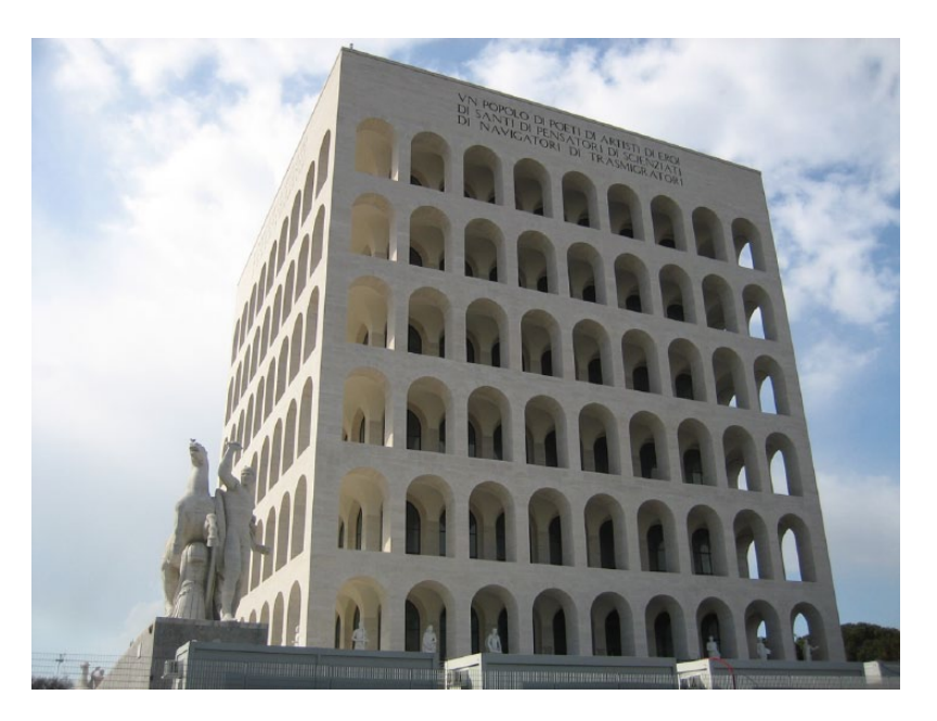
Figure 1. The Palazzo della Civiltà Italiana renamed Palazzo della Civiltà del Lavoro (Office of the Culture of Work) in the EUR neighbourhood.

key strategies was to expand the city towards the sea which 'recalled the outward orientation of imperial Rome' (Agnew, 1995: 49). The highway from Rome to Ostia was completed in 1928 for that purpose.