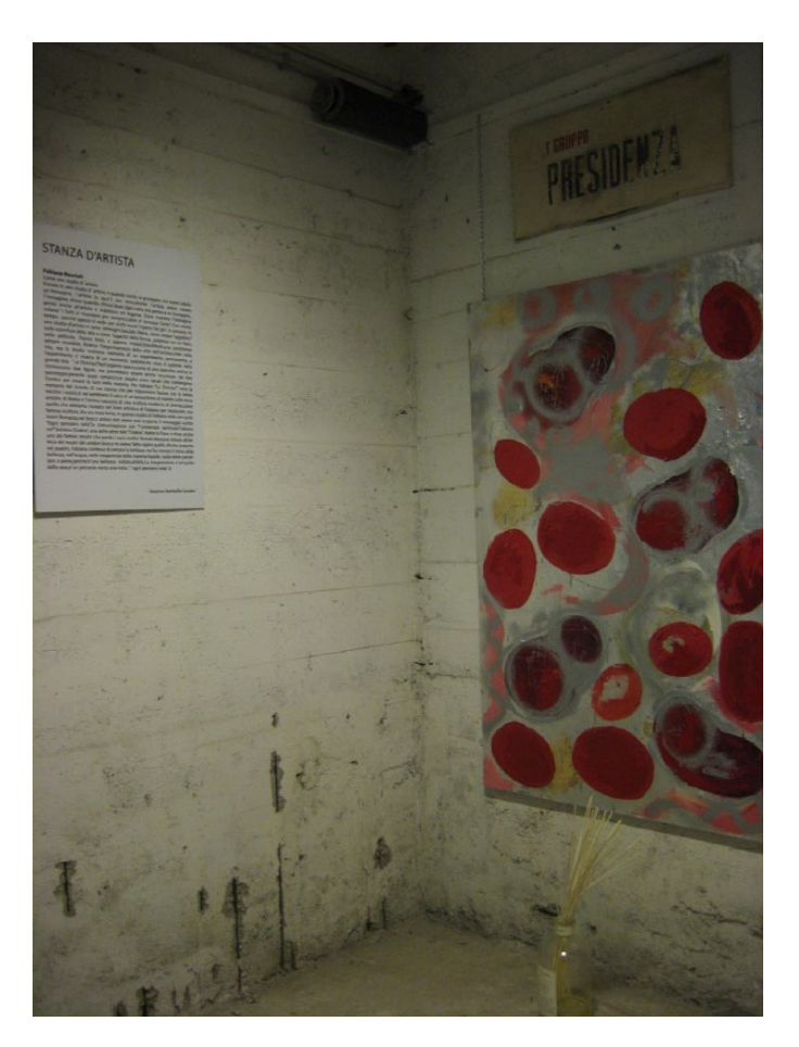
Figure 4. The artist's painting and a touch of infused lavender feature amidst decaying concrete walls and an original sign.

though this is considered to be one of the better conserved bunkers in Rome (Grassi, 2012).