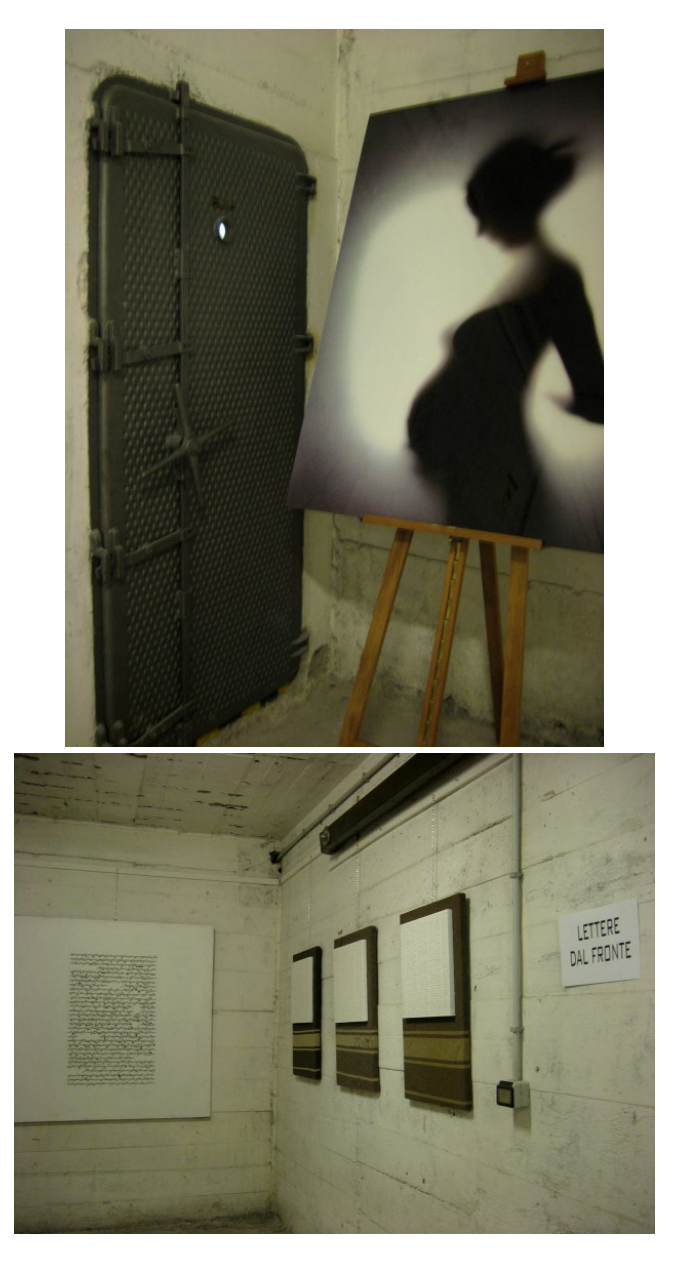
Figures 6 and 7. Other artworks from the exhibition.

Contemporary materials and artworks were added inside the bunker, fraternizing with the decaying walls and original materials such as the signs, the air-proof metal doors and the pipes. All these materials were inextricably bound by the presence and