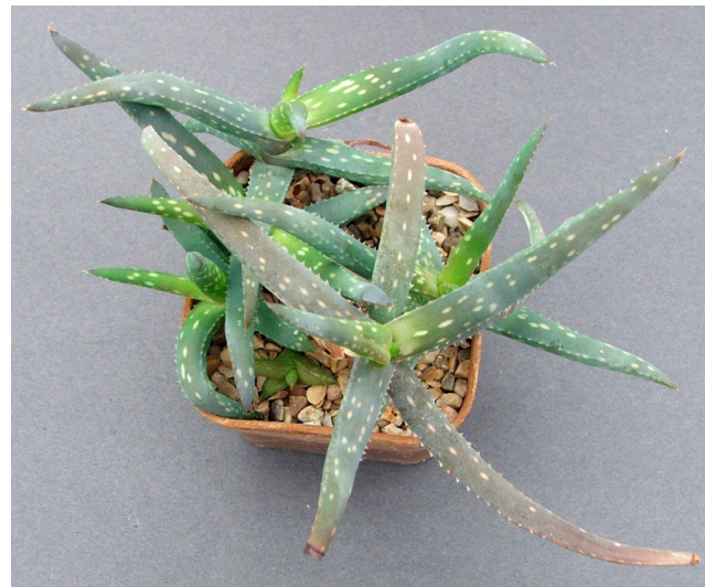
Below: Aloe jacksonii in an 8 cm square pot.