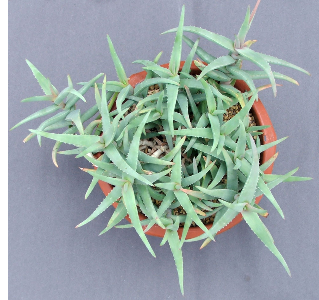
Above: Aloe cremnophila in a 25 cm diameter pot.