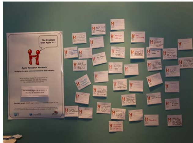
Figure 1: The Challenge Wall at ABC 2013

suggested that researchers should aim to understand the drivers of agile adoption as well as its effects [9]. The call for more research continued in 2009 by Abrahamson et al. [10], who also identified a need for more rigour and industrial studies, as well as highlighting a lack of clarity about what was meant by agility. More recently the research landscape has changed. Both Dingsøy et al in 2012 [11] and Chuang et al in 2014 [12] have reported an increase in published research, indicating a maturing field.