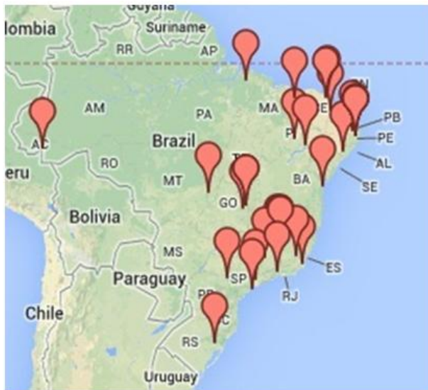
Fig2. Location of the participants of Telecentro.BR

The quantitative and qualitative data from the questionnaires and interviews, which were applied to a random group of 20% of the Telecentro.Br's young educators, indicate that those participants have key digital technology skills (figure3). They are able to manage files, folders, use software tools and applications, create multimedia file, install new tools and devices and a small group are also able to use open source software as well as programming language. A small group of these participants - 15% - do not have computer at home, but all of them access internet from cyber cafés or Telecentro.BR building. Many of them are users of Youtube and FaceBook. All of them have mobile phones and most of them (70%) with Internet.