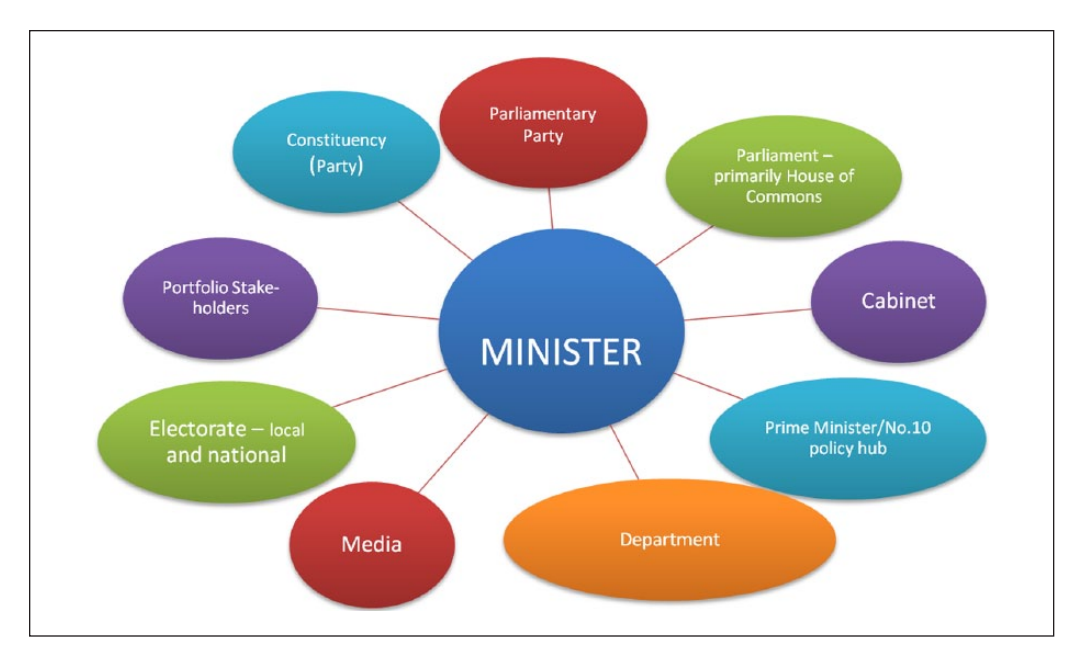
Figure 1. The Multiple Arenas of Ministerial Life.

leadership. Within this literature, there are very few studies of the leadership practices of prominent senior politicians below the level of PM or president. Examining everyday leadership through the lens of multiple social arenas opens up a fresh route to addressing a current gap in knowledge about leadership practices in political settings.