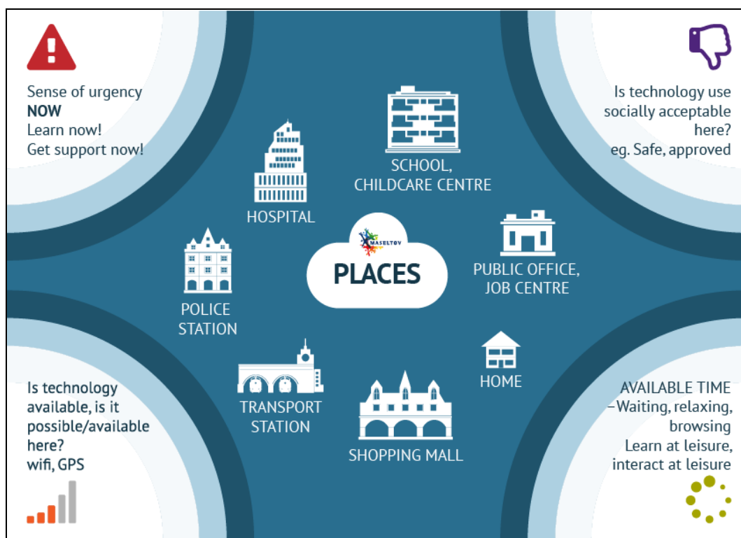
Figure 2. A visualisation of the range of affordances that may be associated with particular places that a MASELTOV service user is likely to encounter during their daily activities.