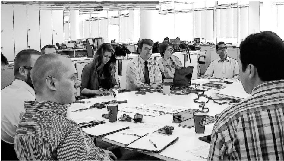
Figure 3. A design workshop, staged against the backdrop of studio life.

joined this scheme's workshops, and others joined in the discussion when passing through the presentation area. This fluidity in engagement in the workshops was possible because these events took place in an open plan space and not in a separate room away from the studio.