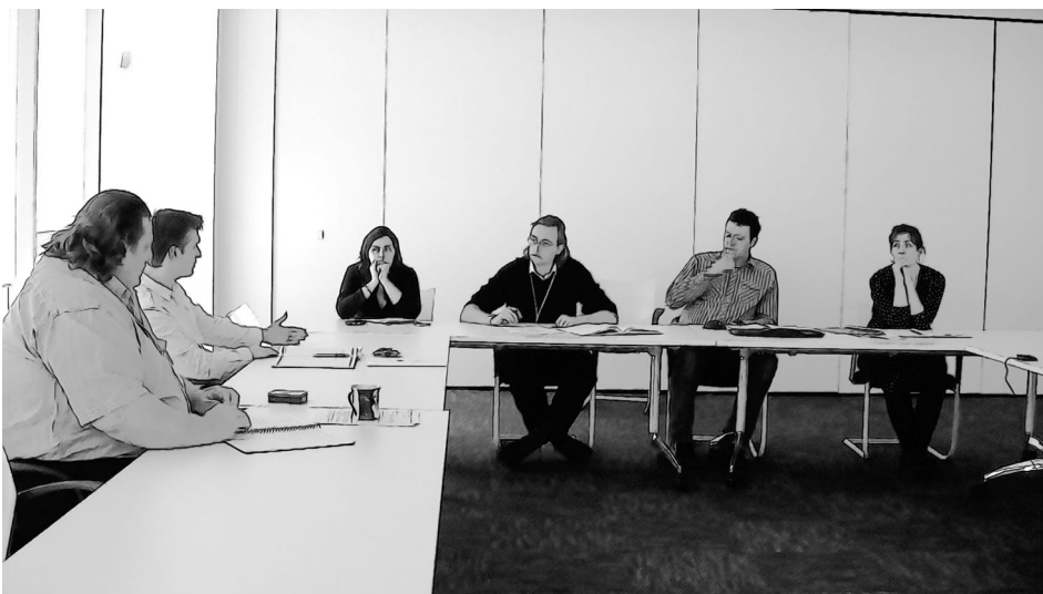
Figure 1. A design coordination meeting.

The design meetings that were held on a routine basis were the design coordination meetings. The design of the project was progressing at a fast pace and design coordination meetings were usually held at weekly intervals (although the frequency of the meetings did vary dependent on the project’s progress). These were organised events, for a planned date when the design team met in person. Design coordination meetings were held in a meeting room within the building (Figure 1) and a