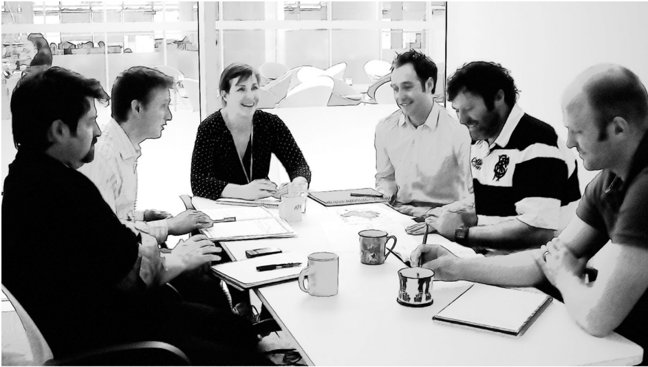
Figure 2. An improvised design meeting.