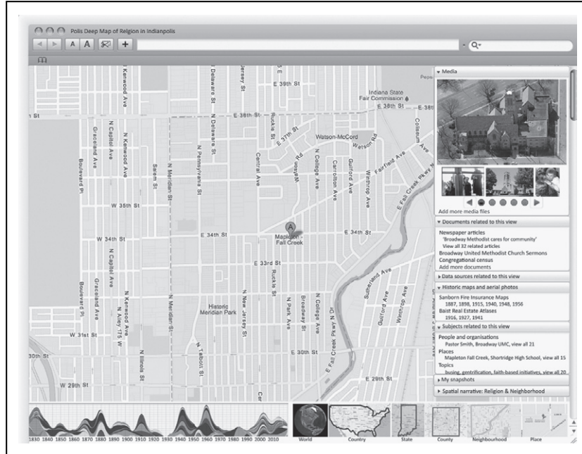
Figure 1. Sample prototype screen zoomed to a neighbourhood view.

movement between close and distant readings over space and time and between sources.