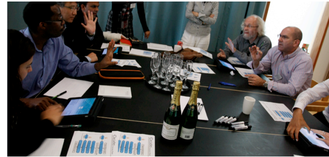
Figure 3: Later the focus shifts to discussing as a team across the table, as participants consider more global perspectives.

The main findings were: (a) Pairs shared tablets equitably. Sharing drove discussion and engagement. (b) Initially, pairs were bubbled together. Collaboration expanded to include the whole table, later both tables: Bubbles within bubbles. (c) Spectators floated, advising different groups, rarely crossing the threshold to touch.