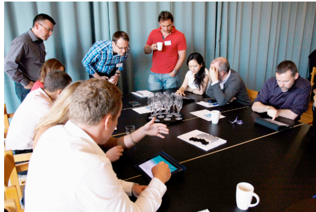
Figure 2: One of two teams/planets in 4Decades. With 4 tablets per team, decisions are initially discussed in pairs at the tablets. Focal attention is on the tablets, including spectators.

The 4Decades simulation [4] was designed to encourage managers from different cultural and professional backgrounds to negotiate climate spending. Comprising 8 tablets and 3 wall displays, it was trialed in four executive training workshops.