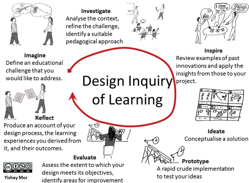
AQ12 Figure 1. The design inquiry of learning cycle.

105 The LDS adopts the studio-based instructional format (Green and Bonollo 2003) to provide an implementation of the DIL approach in university settings. In the LDS, students work in groups on projects of their own choice. Each group identifies a concrete educational context and a specific educational challenge within this context, locates and reviews relevant literature, devises a techno-pedagogical innovation to address the chosen challenge in its context and evaluates their innovation – if