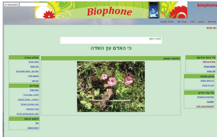
Figure 3. Results from the long-term effect survey.

played a significant part in students' learning process, engendering reflection and critical thinking. It enhanced their inquiry through feedback, support and workload distribution within groups. The feedbacks between groups and sharing the opinions in class discussions helped the students in constructing new meanings and juxtaposition different points of view. The dialogue established among the students and with the teacher and supported by the studio's approach is reflected by the students' reports as a useful method, which alleviated their difficulties in the course.