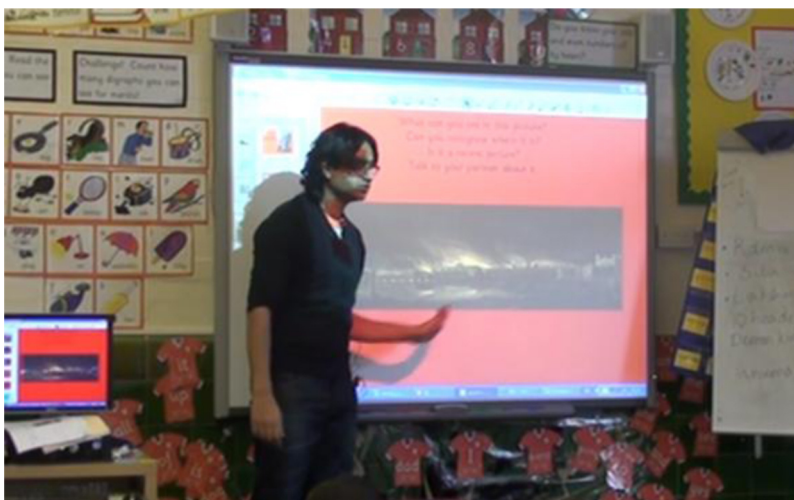
Fig. 2. Image of painting of the Great Fire, lesson 5, 00.45.