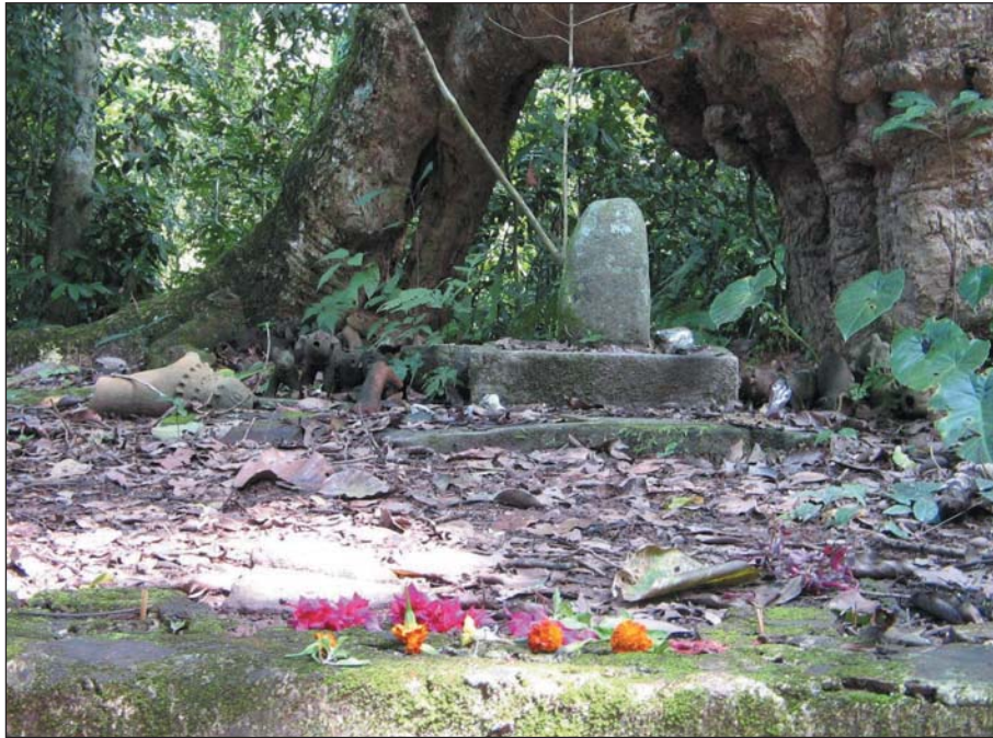
Figure 2. Sacred grove dedicated to the god Aiyappa in Biligunda village, Kodagu, Western Ghats, India. Sacred groves are small patches of forest dedicated to ancestral or deity worship. These patches often have a long history of protection and shelter natural vegetation, including some very old trees.

community, as well as fair enforcement of the agreed rules, strong organizational and institutional arrangements, and constructive dialogue. We agree with Brechin et al. (2002), and would further argue that informal conservation traditions also have a high degree of acceptance among local communities. If the merits of such traditions are recognized and legitimized within ICDPs, there is a strong possibility that ICDPs will work much better than they do at present.